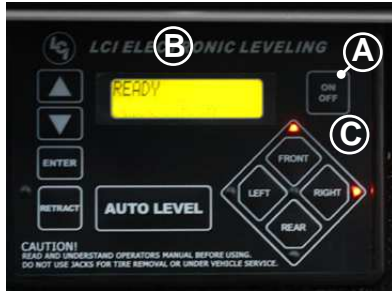
FIG. 2 - Touch Panel