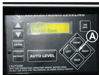
FIG. 3 Touch Panel - Unit Level