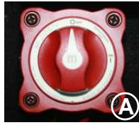
FIG. 1A Off