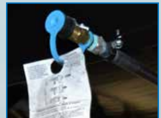
RVQ QUICK CONNECT WITH GRILL