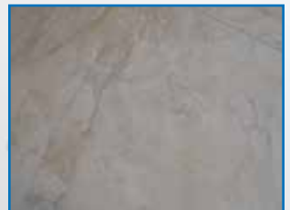
SEAMLESS COUNTER TOPS