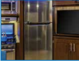
DOUBLE DOOR RESIDENTIAL REFER