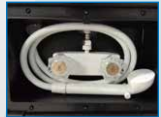
OUTSIDE SHOWER WITH HOT AND COLD WATER