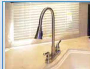
PULLOUT KITCHEN FAUCET