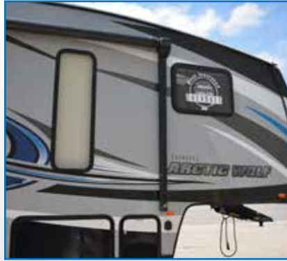
ENHANCED FIBERGLASS HIGH GLOSS SIDEWALLS