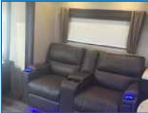
CUSTOM DELUXE FURNITURE WITH TRI-FOLD SLEEPER SOFA