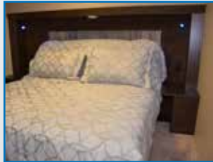
EVERGREEN UPGRADED MATTRESS