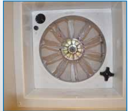
QUICK COOL FANTASTIC FAN