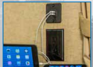
USB CHARGING STATIONS