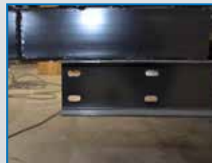
REAR RECEIVER HITCH PREP