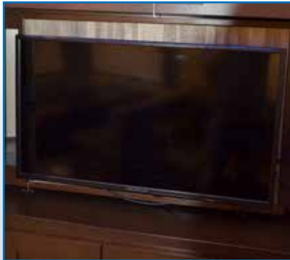
LARGE LED TV