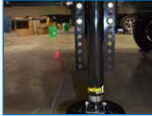
3.0 GROUND CONTROL AUTO LEVELING SYSTEM