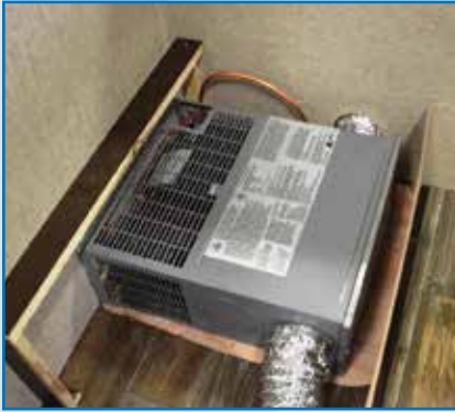
35,000 BTU FURNACE