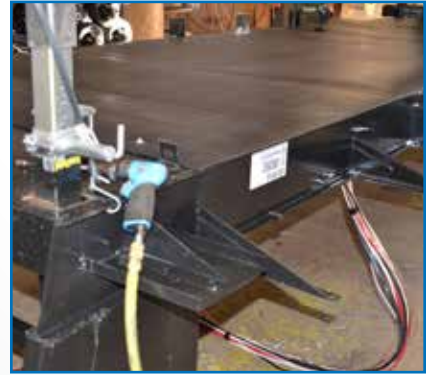
HEATED AND ENCLOSED UNDERBELLY