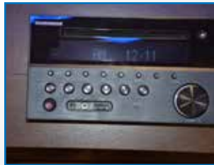
HOME ENTERTAINMENT SYSTEM