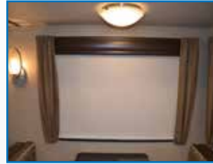
BLACK OUT ROLLER SHADES IN MAIN FLOOR