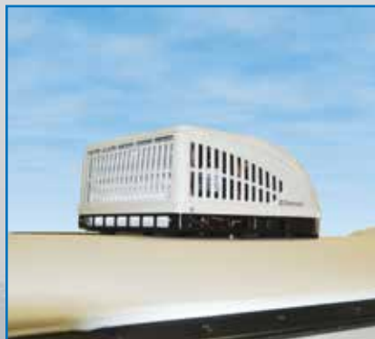
2ND A/C IN BEDROOM