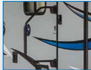
LARGE EXTERIOR FOLDING ENTRY ASSIST HANDLE