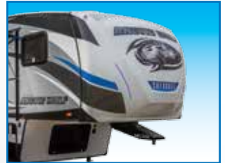
GEL COATED HIGH GLOSS FIBERGLASS FRONT CAP