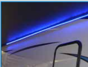
LED INTERIOR AND EXTERIOR LIGHTING