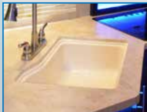
POTS AND PANS CAPACITY UNDERMOUNTED SINK