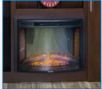
FIREPLACE WITH 5,200 BTU HEATER