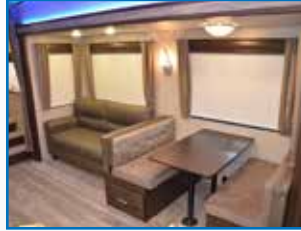
6'4" SLIDES WITH OVERSIZED PANORAMIC WINDOWS