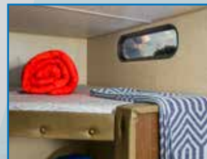
UPPER BUNK WINDOW