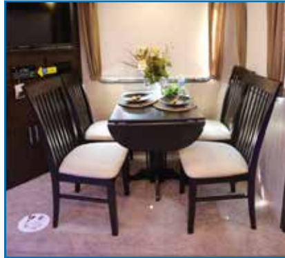
FREE STANDING TABLE AND CHAIR