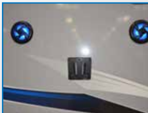
OUTSIDE TV BRACKET WITH HOOKUPS