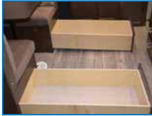
40" DINETTE DRAWERS