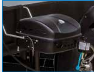
EXTERIOR CAMP KITCHEN**