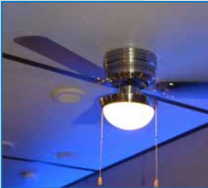
HIGH CIRCULATION CEILING FAN