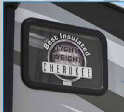
UPGRADED ARCTIC INSULATION