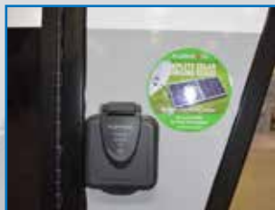
SOLAR PREP AND WIRING