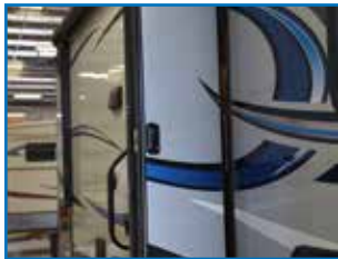
FRICITION HINGE ENTRY DOOR