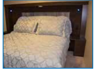
COMFORT POWER MASTER BED LIFT SYSTEM