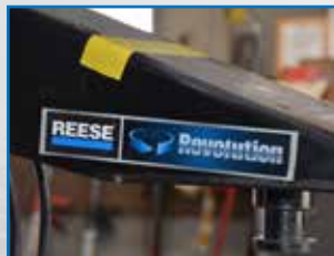
REESE REVOLUTION PIN BOX