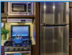
STAINLESS KITCHEN SUITE APPLIANCE PACKAGE