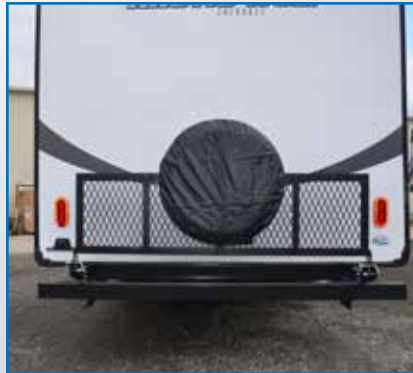
REAR BIKE RACK