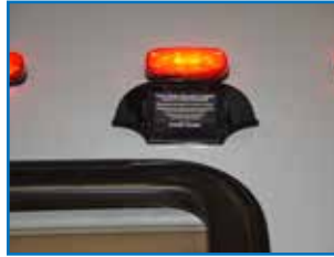
BACK UP CAMERA PREP