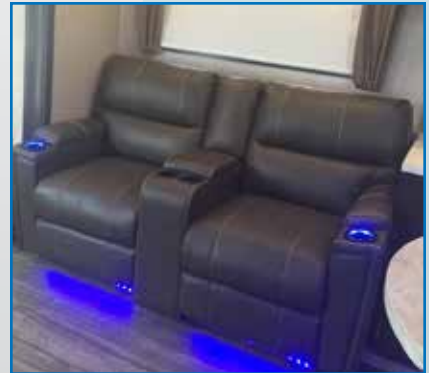
POWER THEATER SEATING (STANDARD ON 285)