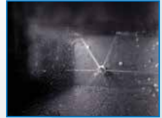
BLACK TANK FLUSH