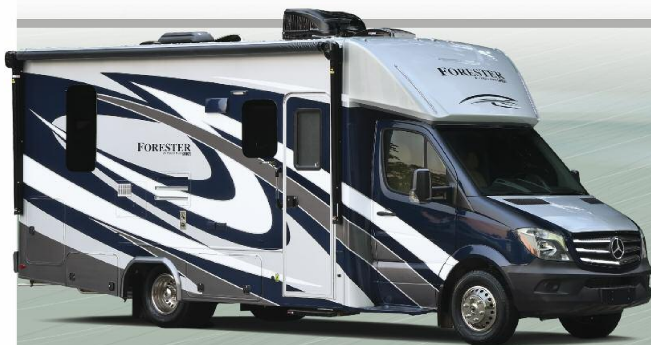
Cobalt full body paint option