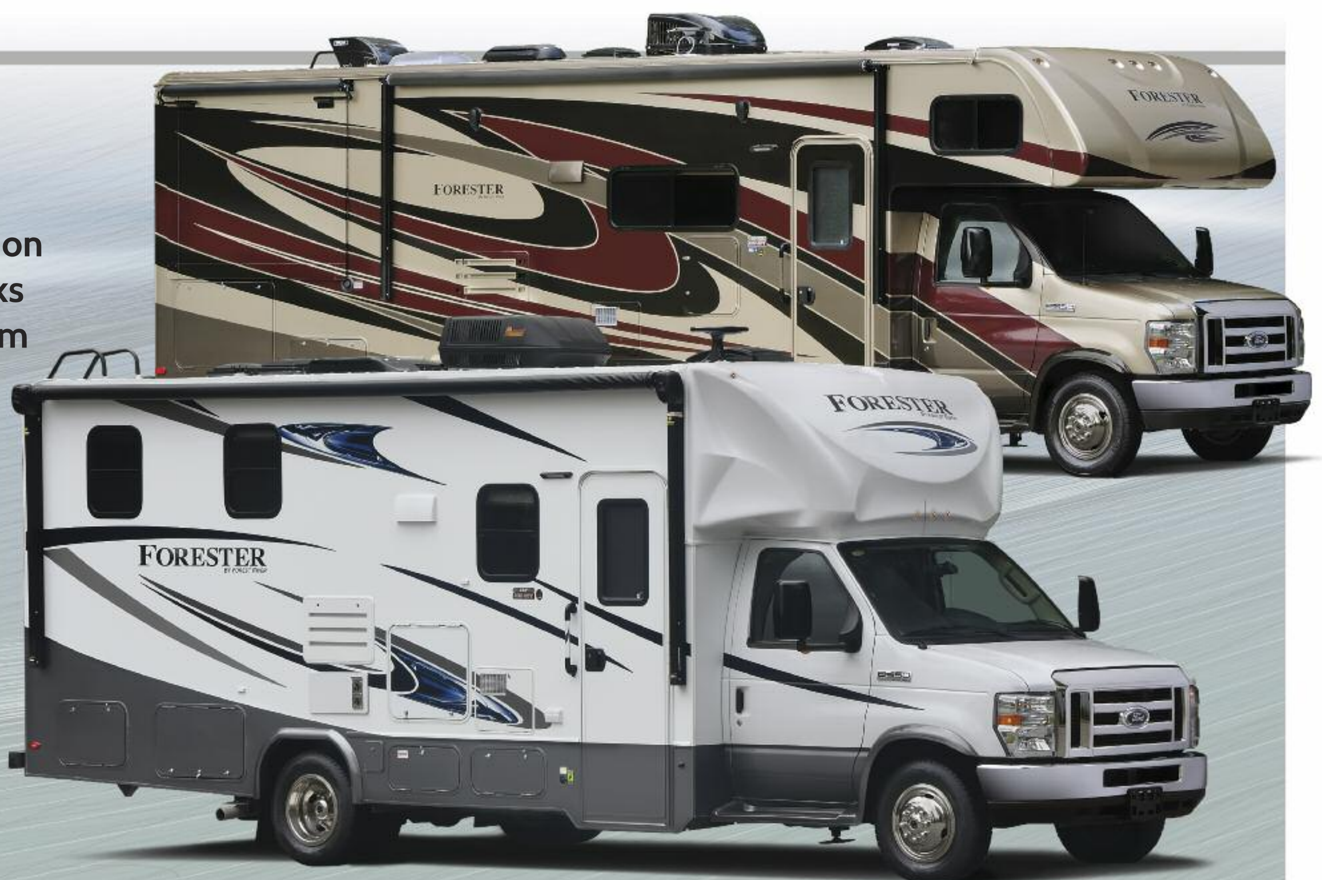
Mocha full body paint option shown above, Trekker front cap option below