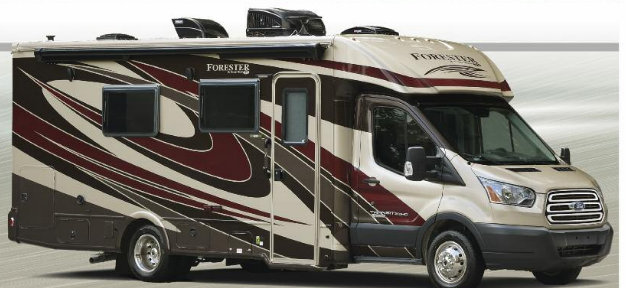
Mocha full body paint option