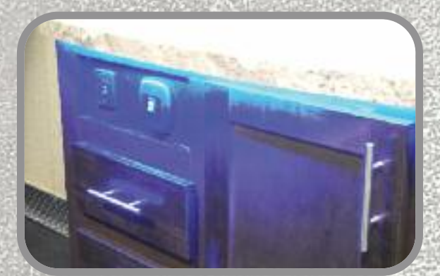
LED Accent Lighting