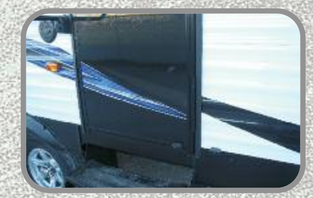
Friction Hinged Entry Door