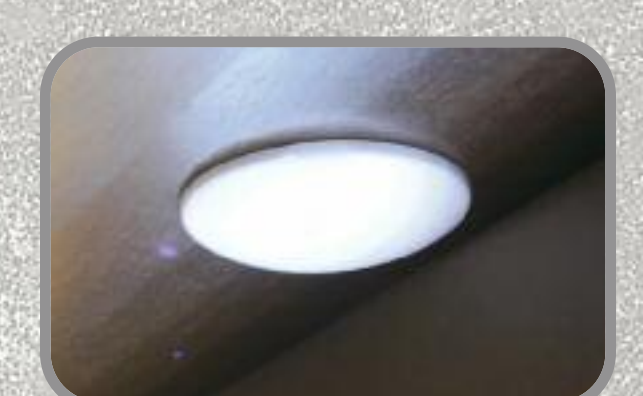
Energy Saving LED Interior Lights