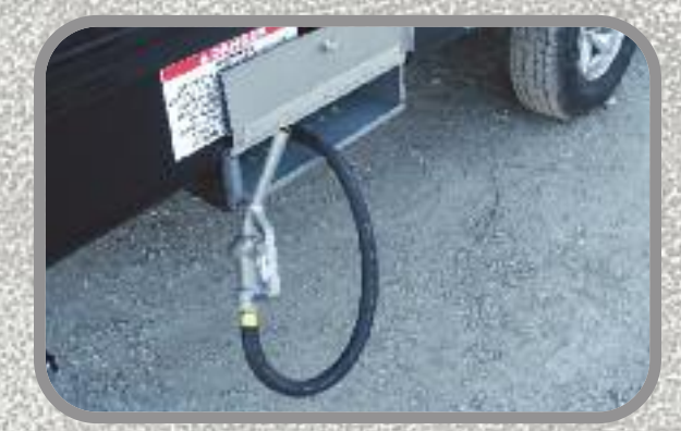
30 Gallon Fuel Station