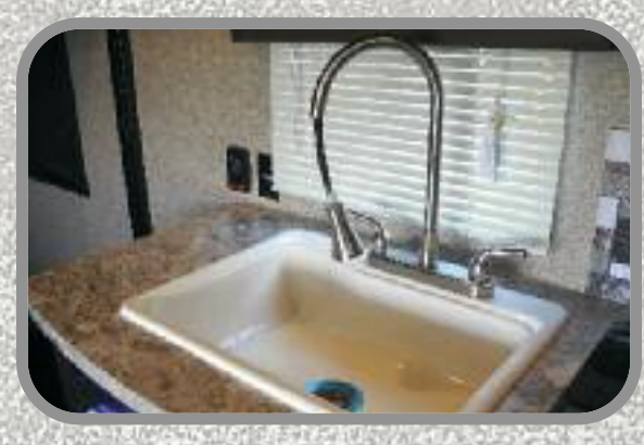
Pull-out High Rise Kitchen Faucet