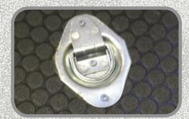
2500 Lb. Tie-downs