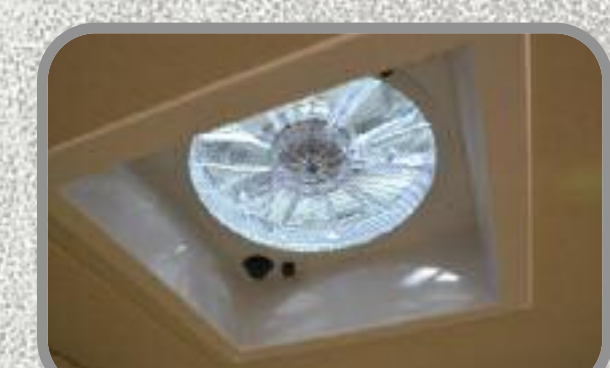
Fantastic Bath Ventilation Fan