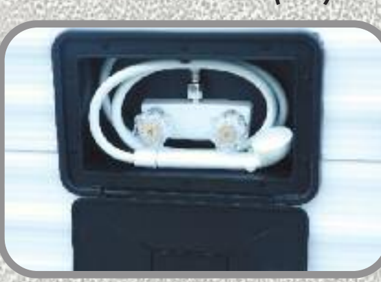
Exterior Shower with Hot and Cold Water