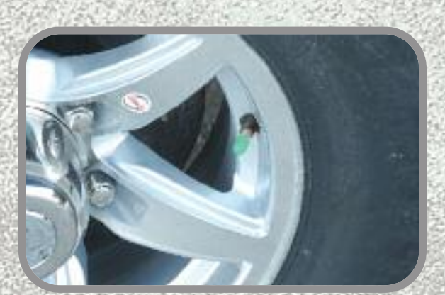
Nitrogen Filled Tires with Aluminum Rims