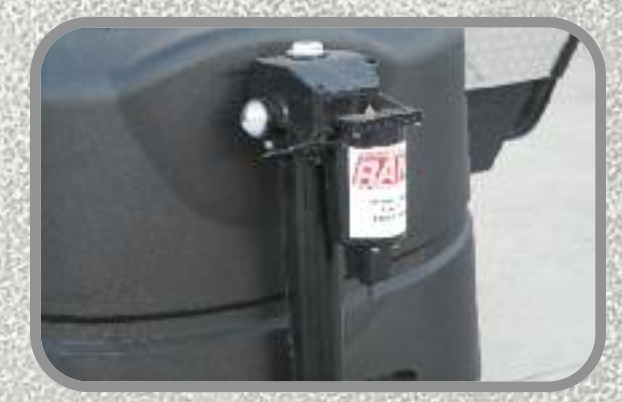
Power Tongue Jack