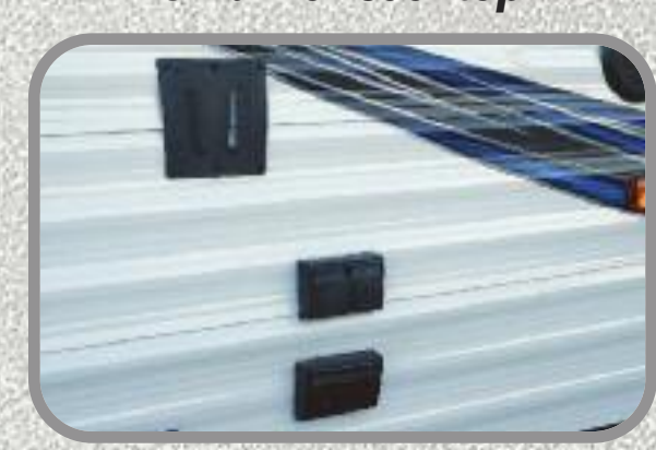
Outdoor TV Bracket and Hook-up