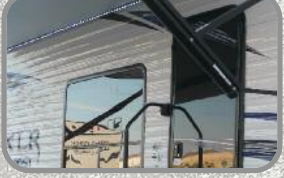
Adjustable Power Awning with LED Lights