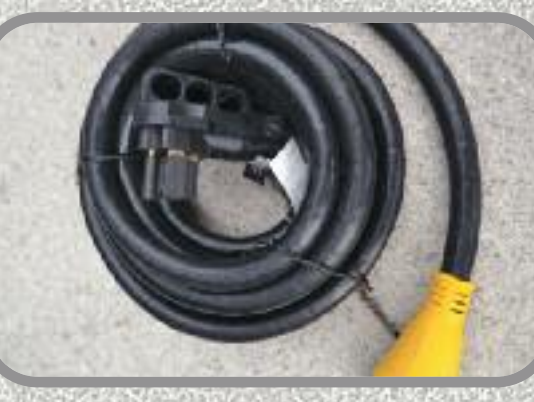
50 Amp Service with Detachable Cord (FW)