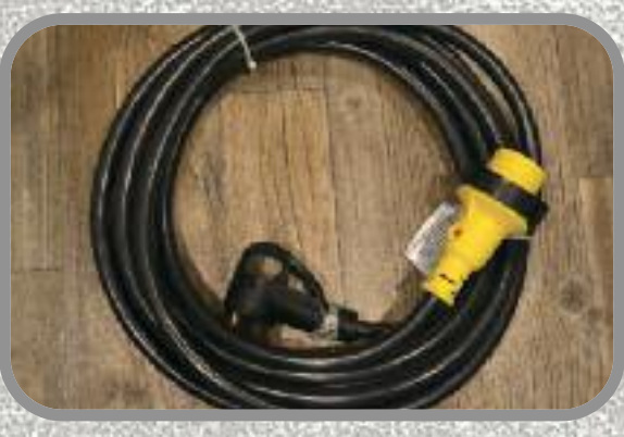
30 Amp Service with Detachable Cord (TT)