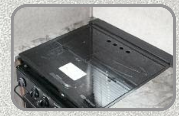
Convection Microwave and 3-Burner Cooktop