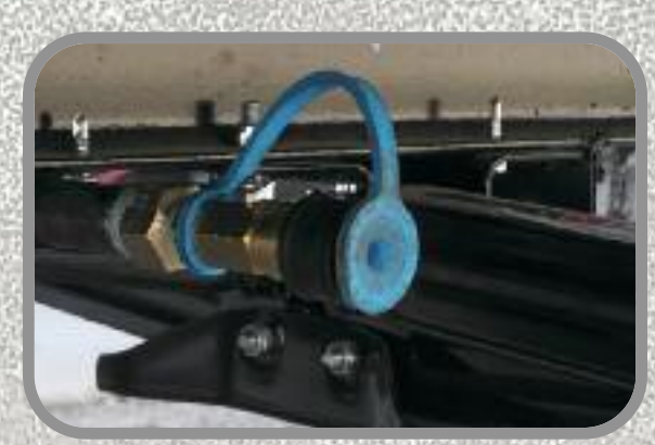
Outdoor Grill Quick Disconnect