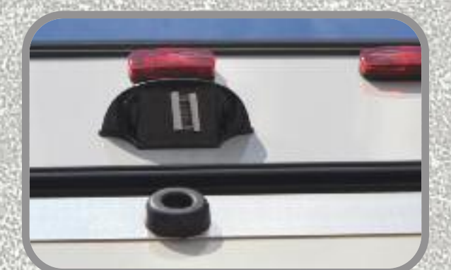
Back-up Camera Ready