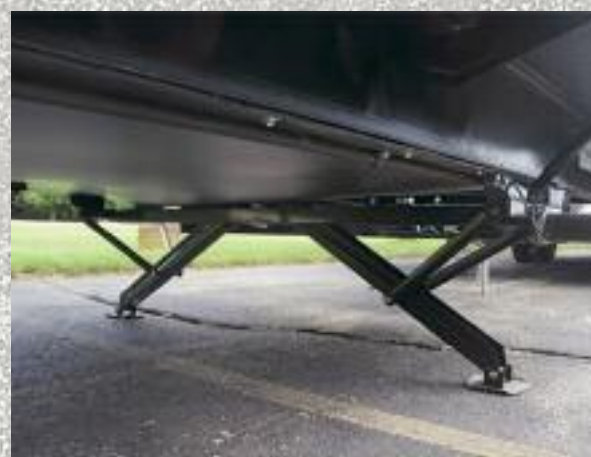
Electric Stabilizer Jacks