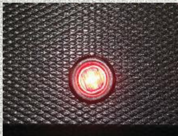
N.O.S. Red Light Under Solid Entry Steps

UP TO $3526 RETAIL VALUE OF FREE UPGRADES!