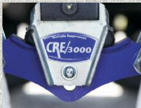
MORryde CRE Suspension Enhancement System