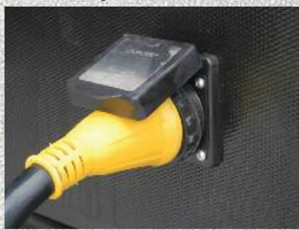
50 AMP Service