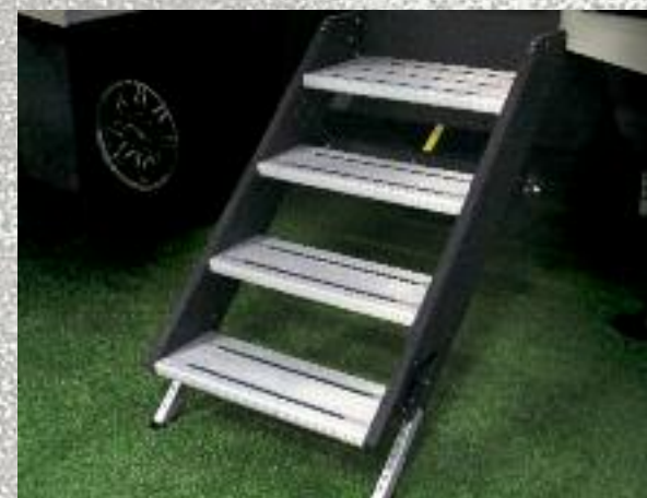
Upgraded Quad Main Entry Steps