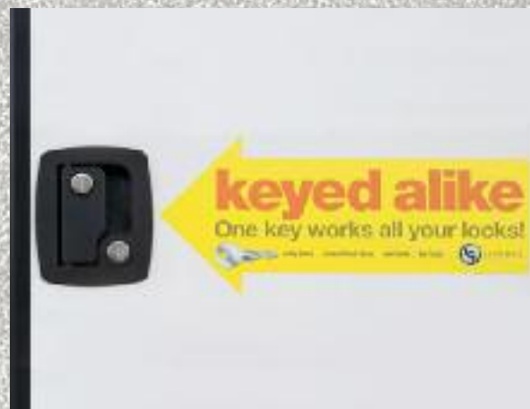
Keyed Alike - Single Key Lock System