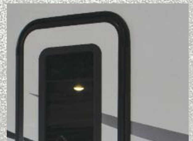
Main Entry Door with Friction Hinge and Auto-close Screen Door