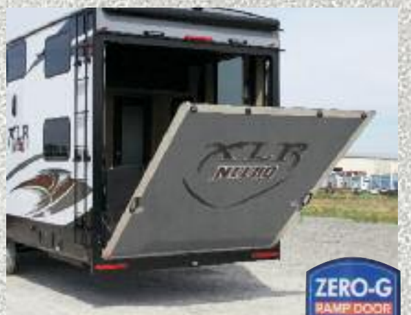
MORryde Zero G Ramp Door