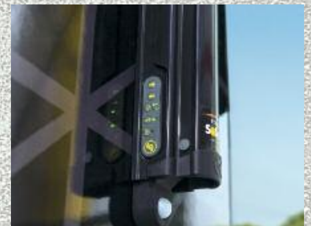
Electric Awning with LED Lights