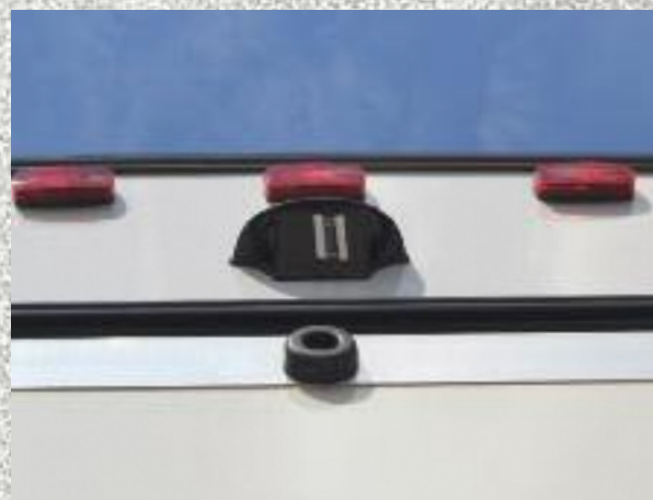
Rear Vision Camera Pre-wire