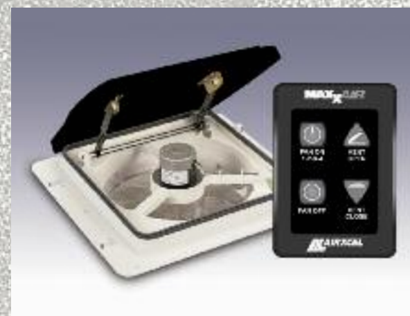
MaxxAir Power Roof Vent Bathroom