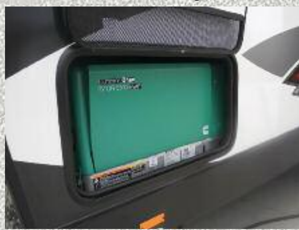
Large Generator Box (Generator not included)