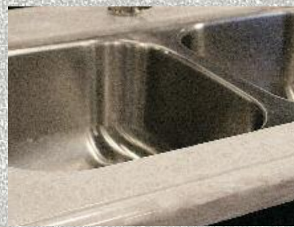
LG Solid Surface Kitchen Countertop