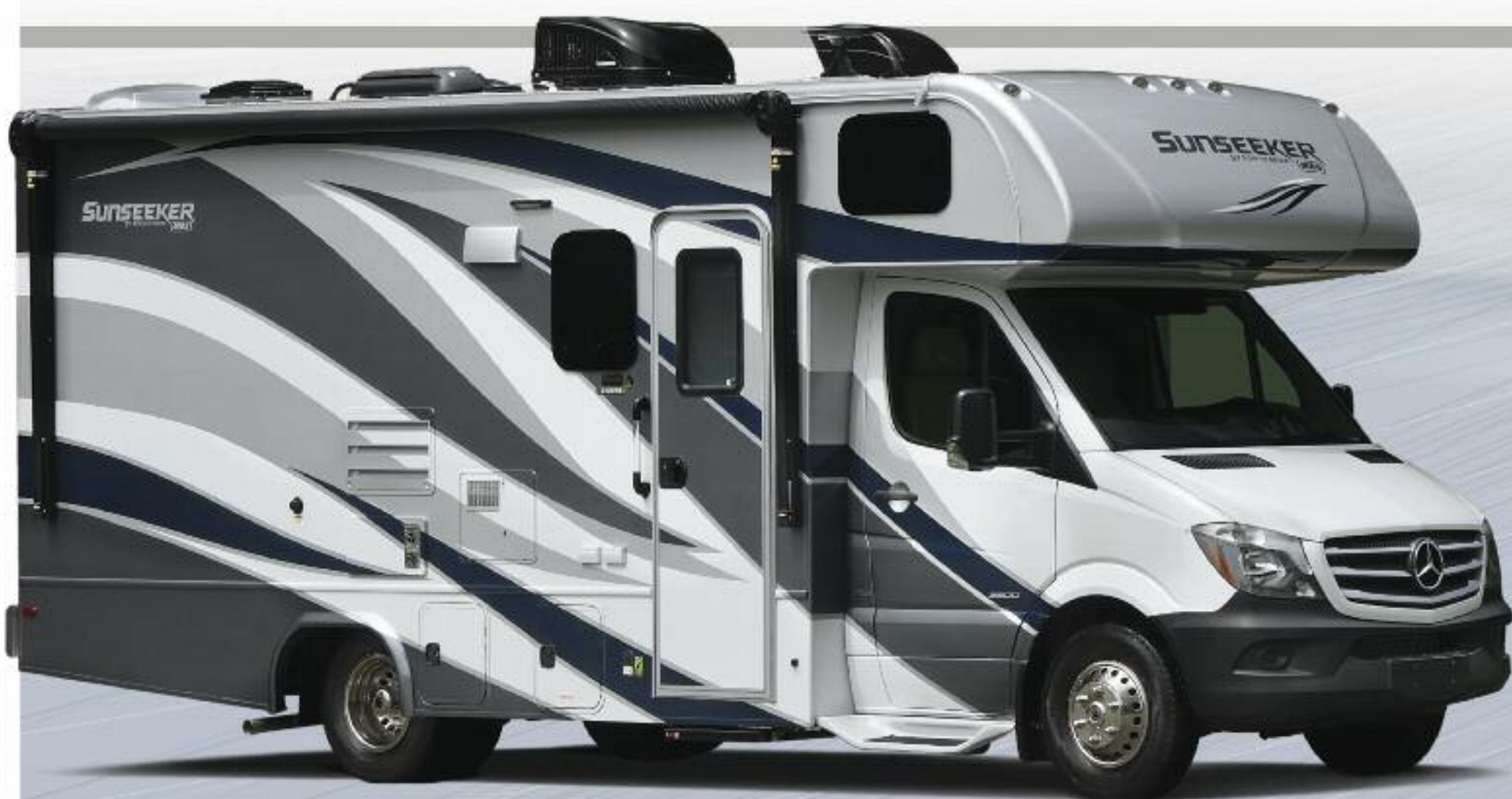
Oxford full body paint option shown