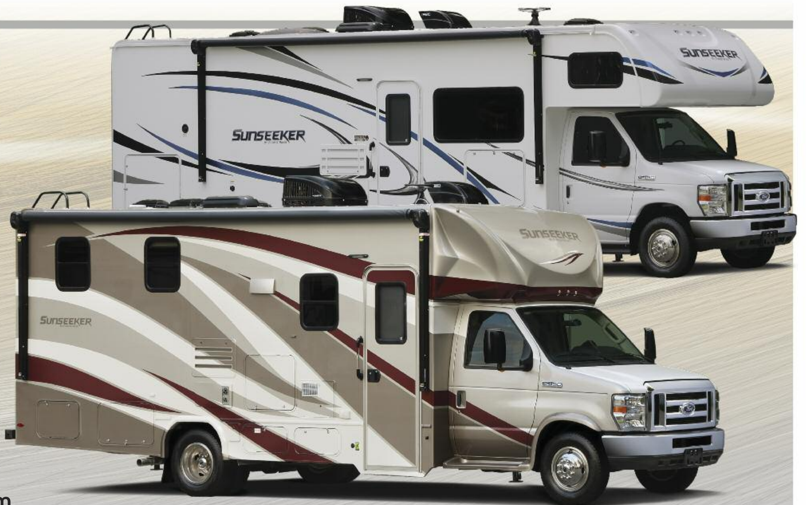
Topaz full body paint option shown