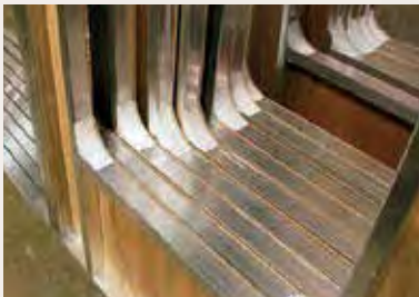
Aluminum window frames.