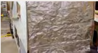
R-38 Radiant shield therma-foil wrap through ceilings, underbellies and under front caps.