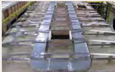
High-Performance Quiet Zone™ ducted air system with a 15,000-BTU HP air conditioner, a residential-style return air duct system and comfort control center, creates a dynamic combination for powerful results. It's the most efficient AC system in existence with both the industry's highest performance AC and the industry's lowest power draw, with second bedroom air conditioner too!