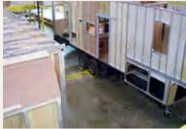
Cedar Creek's famous residential all aluminum super-structure (Roof, sidewalls, and floor) on 16" centers or less.