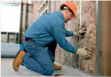
Residential glass wool insulation, designed by nature.