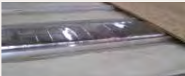
3" Aluminum floor studs, heat duct and 5/8" tongue and groove plywood floor.