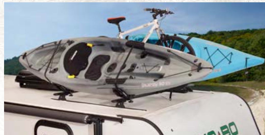
Rhino Rack Rooftop System