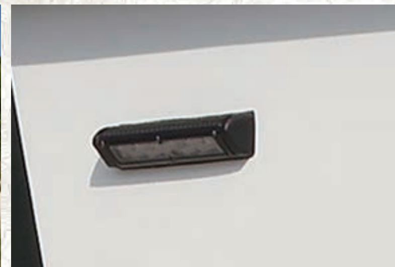
STANDARD Scare Light 1000 Lumen Amber/White