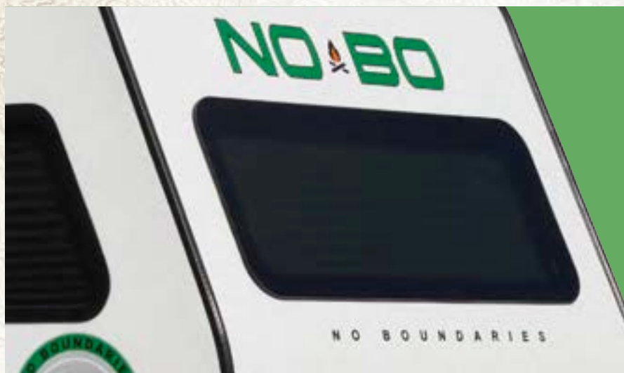
Tempered Seamless Panoramic Front Window