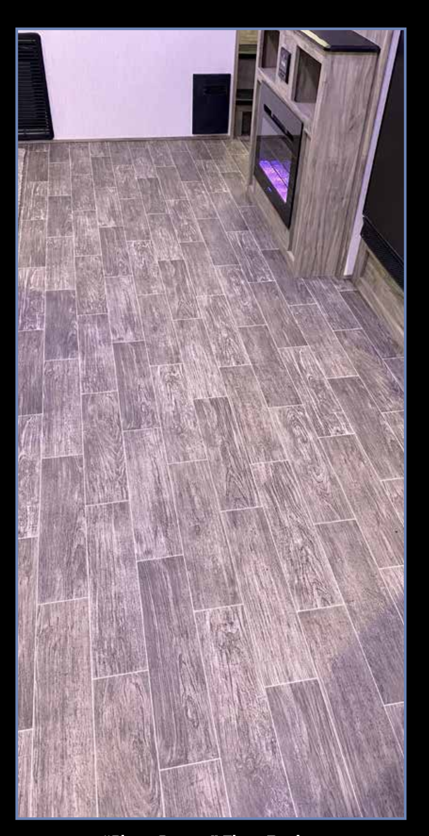
"Clean Sweep" Floor Design (No Heat Vents)