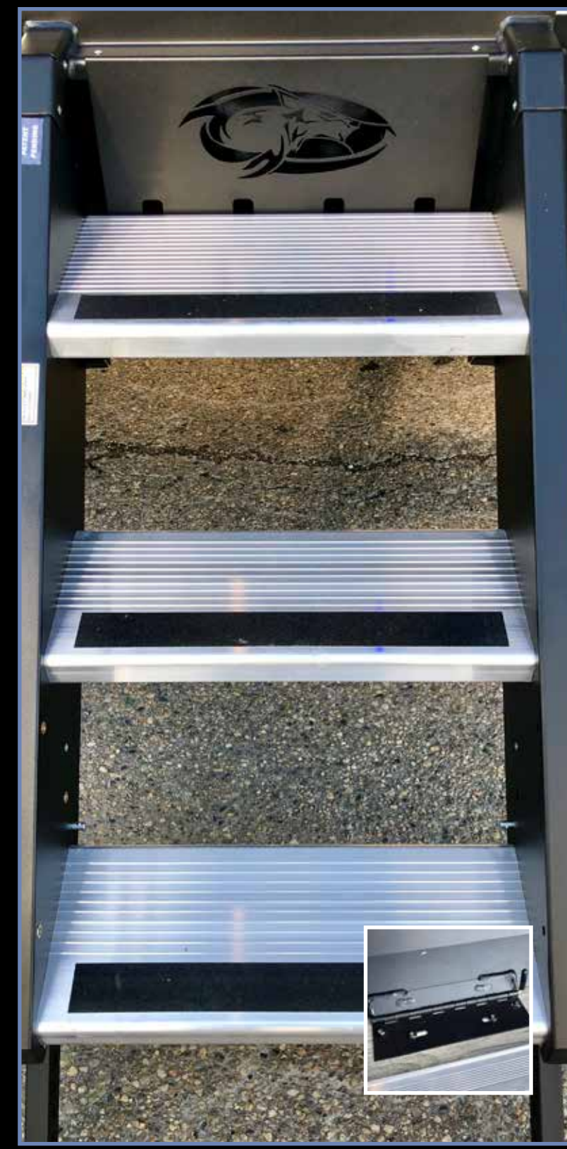
Cherokee Exclusive Exterior Step[s] with Oversized Landing, 600LB. Capacity, Quick Release and Kick Plate