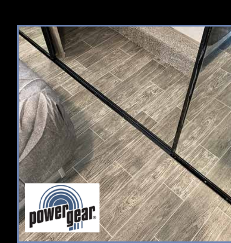
Power Gear™ Frame Technology and Space Saver Rail Design