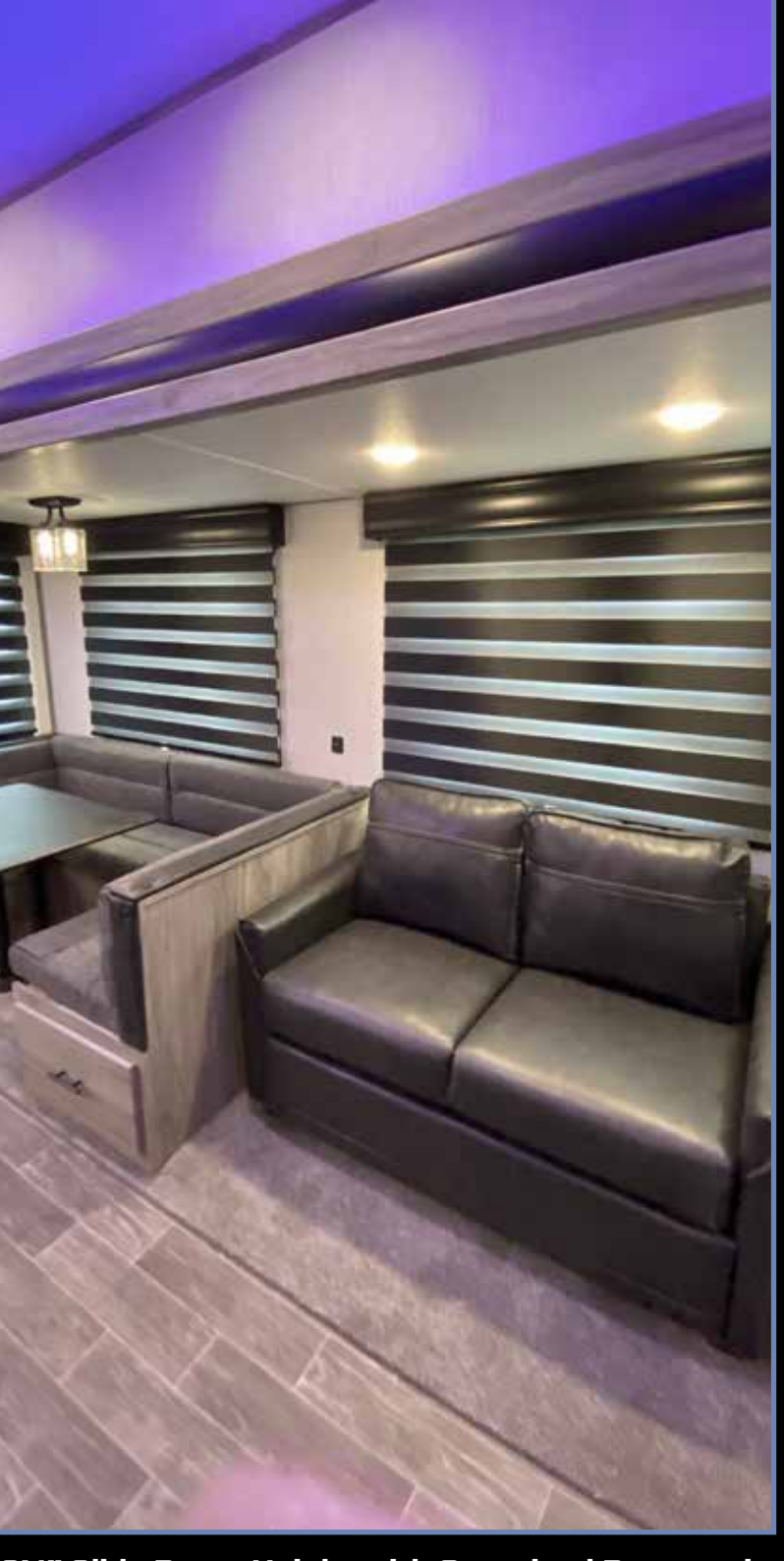
6'4" Slide Room Height with Oversized Panoramic Windows (Main Level Floor Slides)