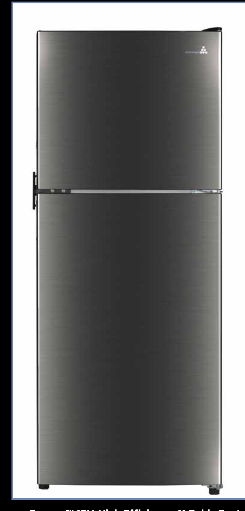
Cannon™ 12V, High Efficiency, 11 Cubic Foot Residential Refrigerator with Travel Lock