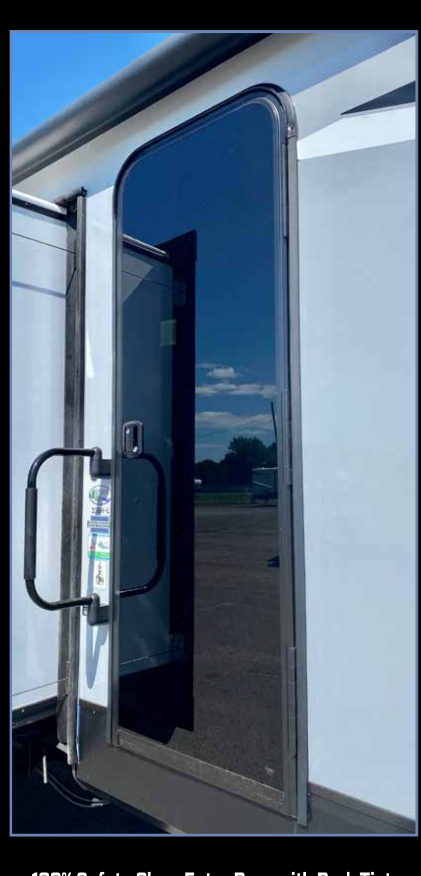
100% Safety Glass Entry Door with Dark Tint, Friction Hinge, Viewing Window and Shade Prep