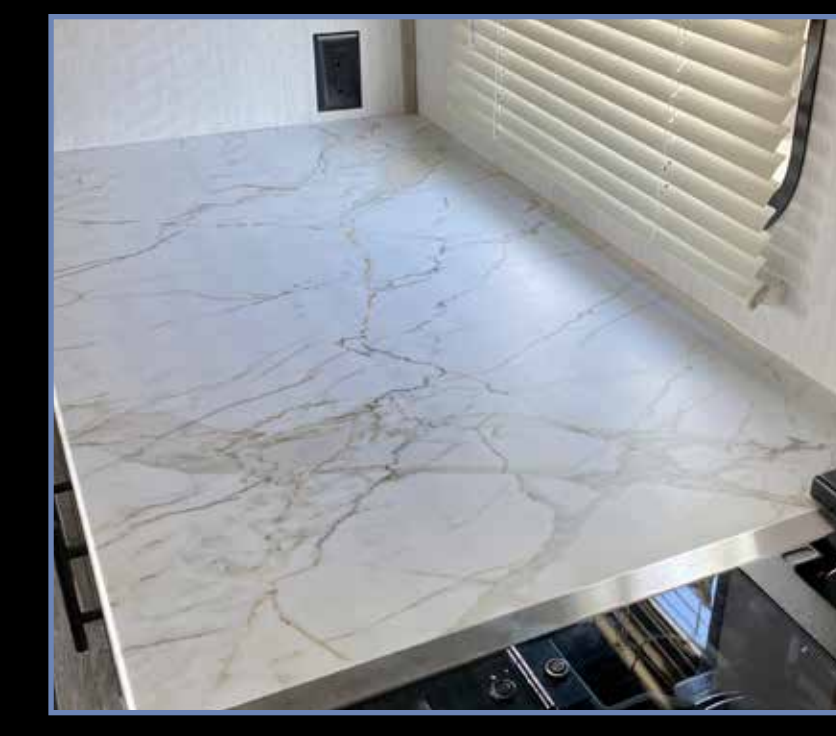
Seamless Counter Tops Throughout