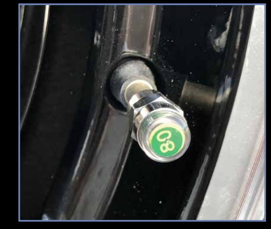
Tire Pressure Safety Sensors