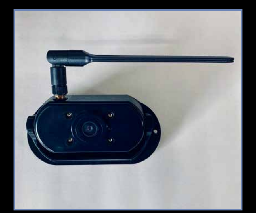
Rear Observation Camera with Bluetooth Connectivity and Operation