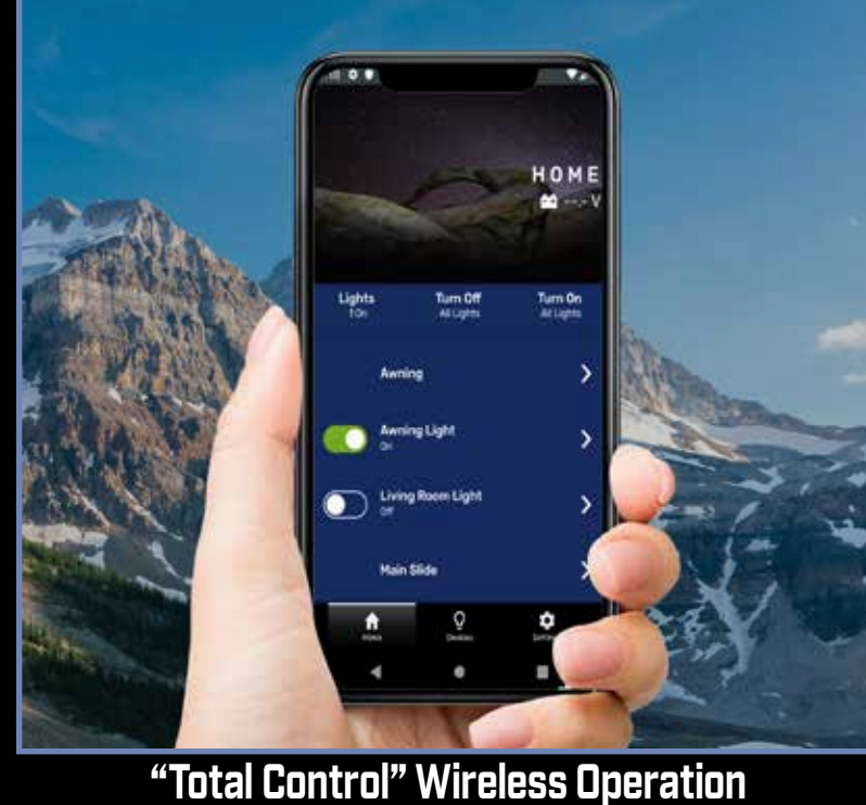
of Auto Leveling, Multiple Light Zones, Awning[s], Monitor Panel and All Slides