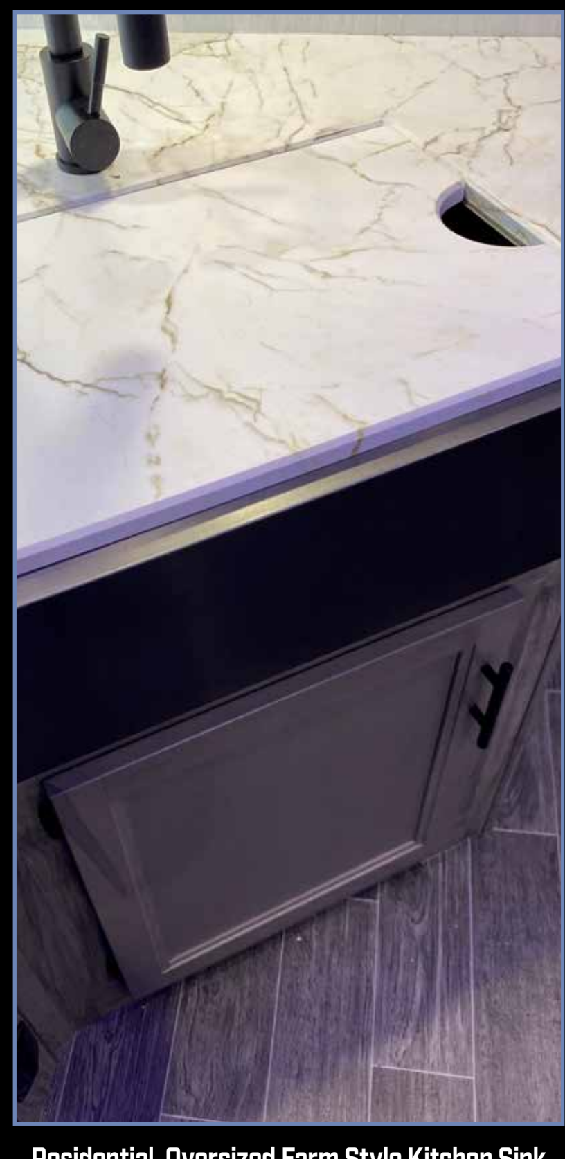
Residential, Oversized Farm Style Kitchen Sink with Flush Mount Cover