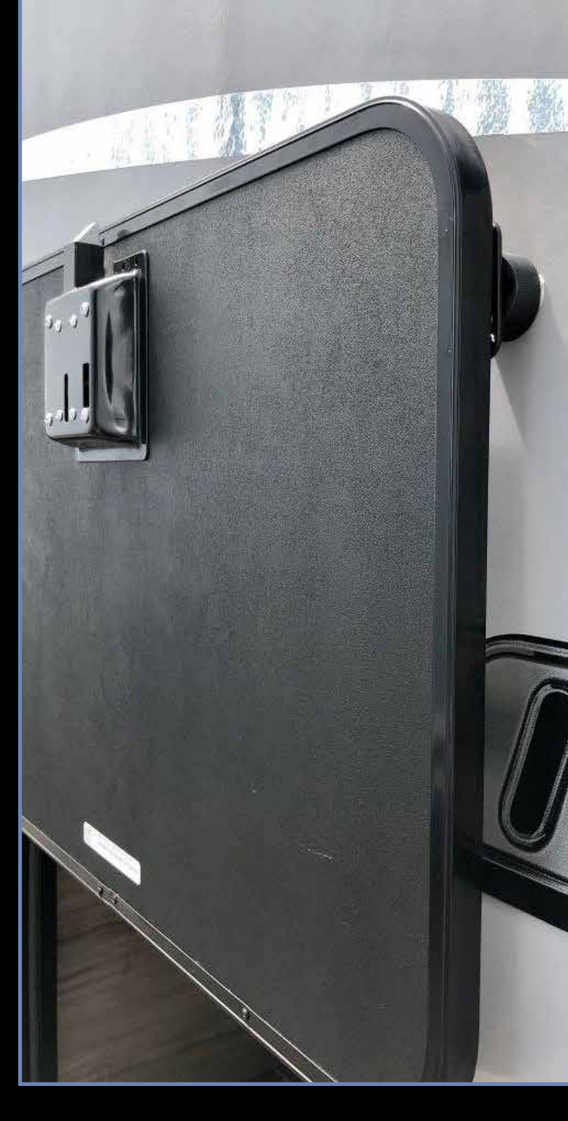
Slam Latch Compartment Doors with "Safety Stay" Magnet Technology