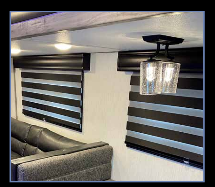
"Zebra Shades" In Main Living Area (Light Filtering with Blackout Capability)