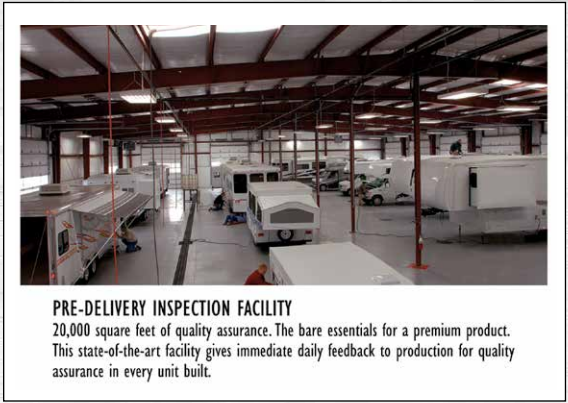
PRE-DELIVERY INSPECTION FACILITY 20,000 square feet of quality assurance. The bare essentials for a premium product. This state-of-the-art facility gives immediate daily feedback to production for quality assurance in every unit built.

GVWR (Gross Vehicle Weight Rating) - is the maximum permissible weight of the unit when fully loaded. It includes all weights, inclusive of all fluids, cargo, optional equipment and accessories. For safety and product performance do NOT exceed the GVWR.