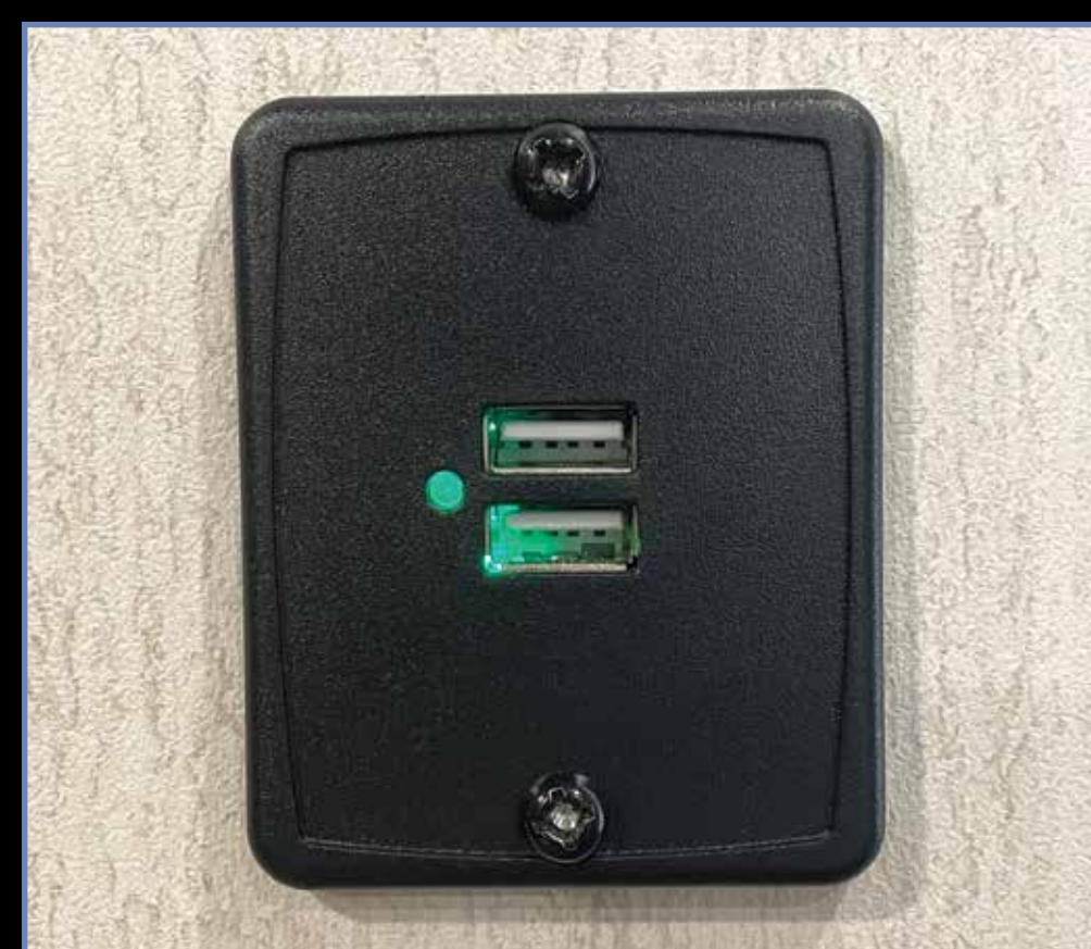
Dual Port USB Charging Stations (Multiple Locations in Living, Kitchen, Bed and Bunk Area)