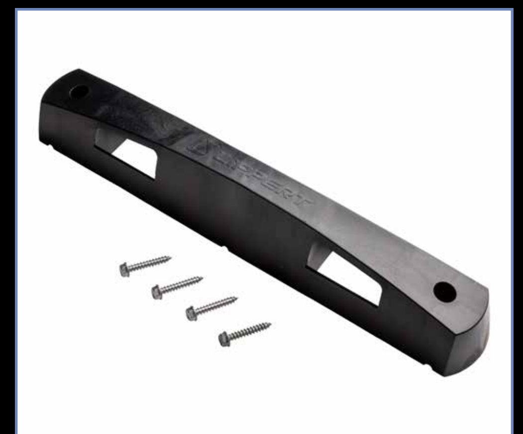
On The Go™ Rear Ladder Prep