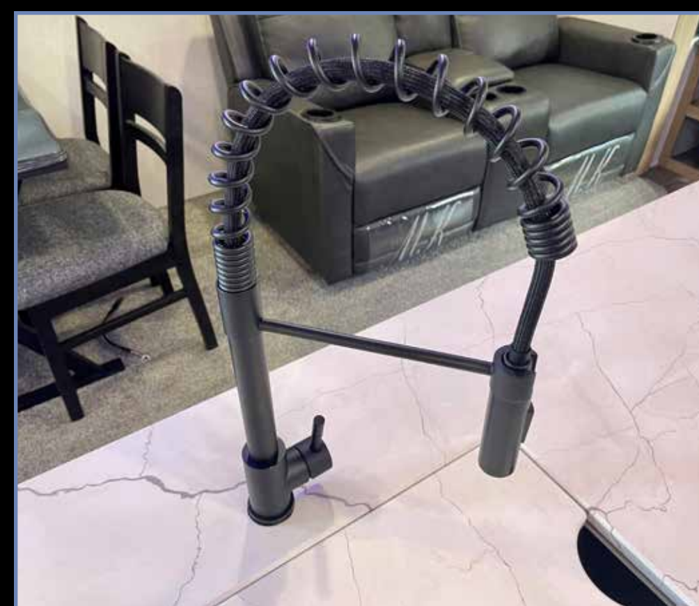
Commercial Grade Spring Spout Kitchen Faucet with Pull-out Sprayer