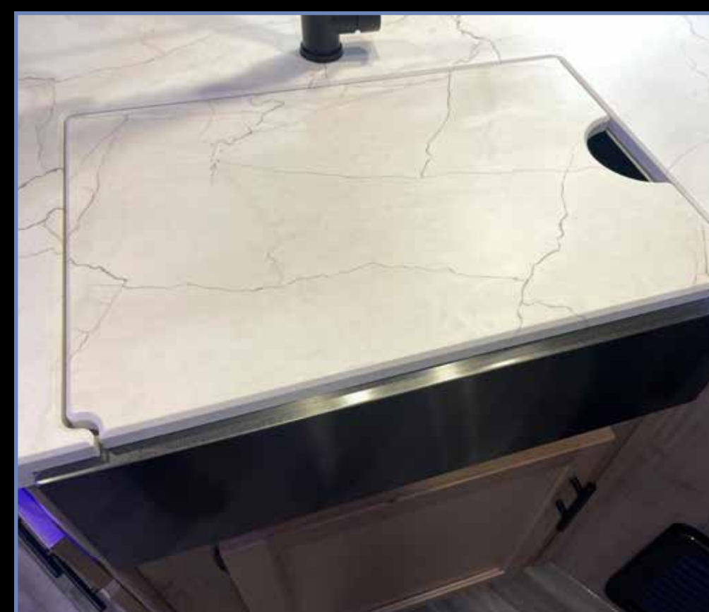
Residential, Oversized Farm Style Kitchen Sink with Flush Mount Cover