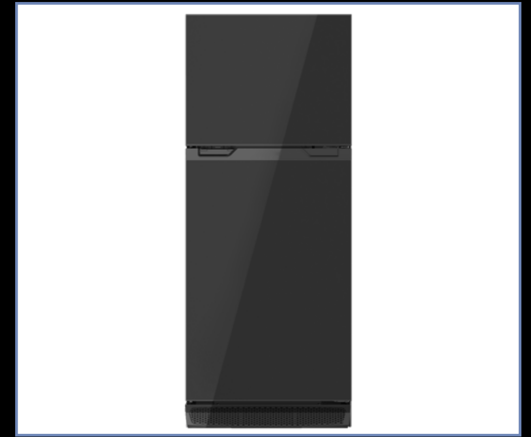
12V, High Efficiency, 10 Cubic Foot Residential Refrigerator with Travel Lock