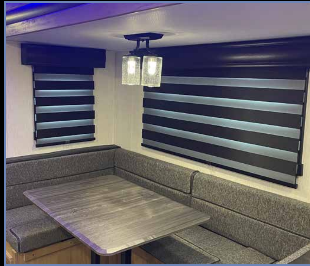
"Zebra Shades" in Main Living Area (Light Filtering with Blackout Capability)