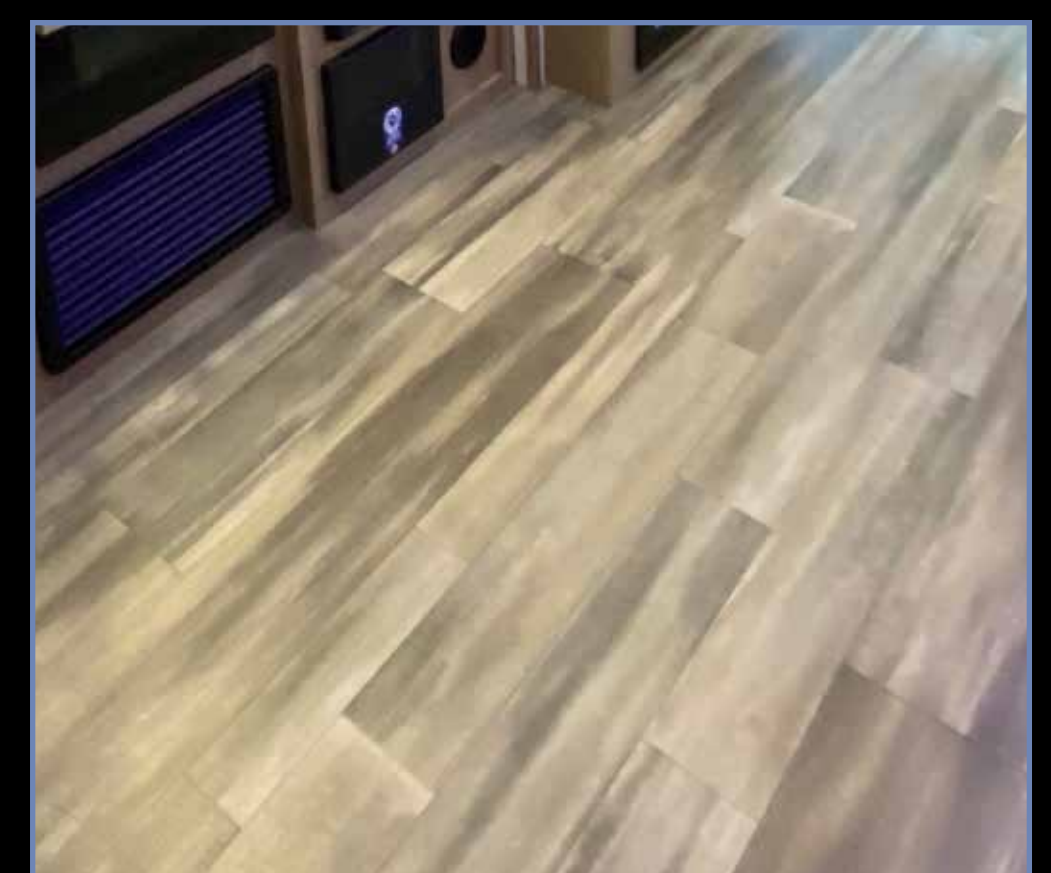
Pet Friendly "Clean Sweep" Floor Design (No Heat Vents)