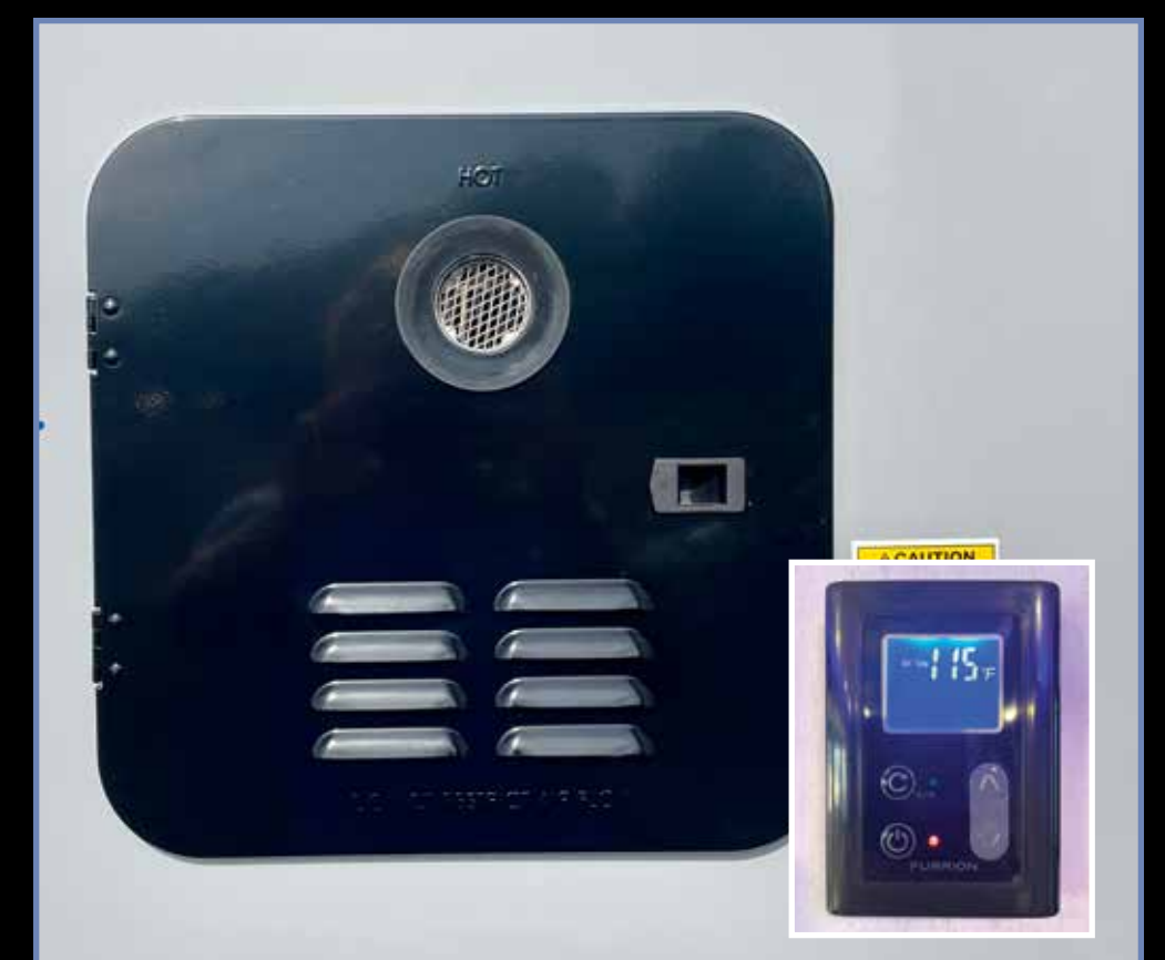
On Demand Tankless Hot Water Heater