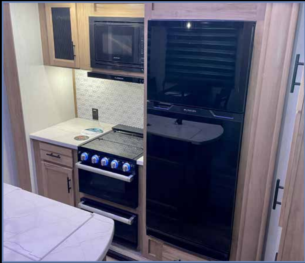
"Blackout" Kitchen Appliance and Hardware Package