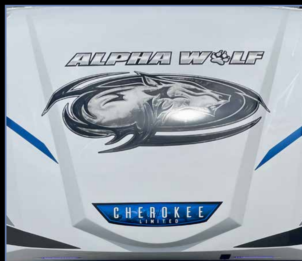
High Gloss Gel Coated Front Cap