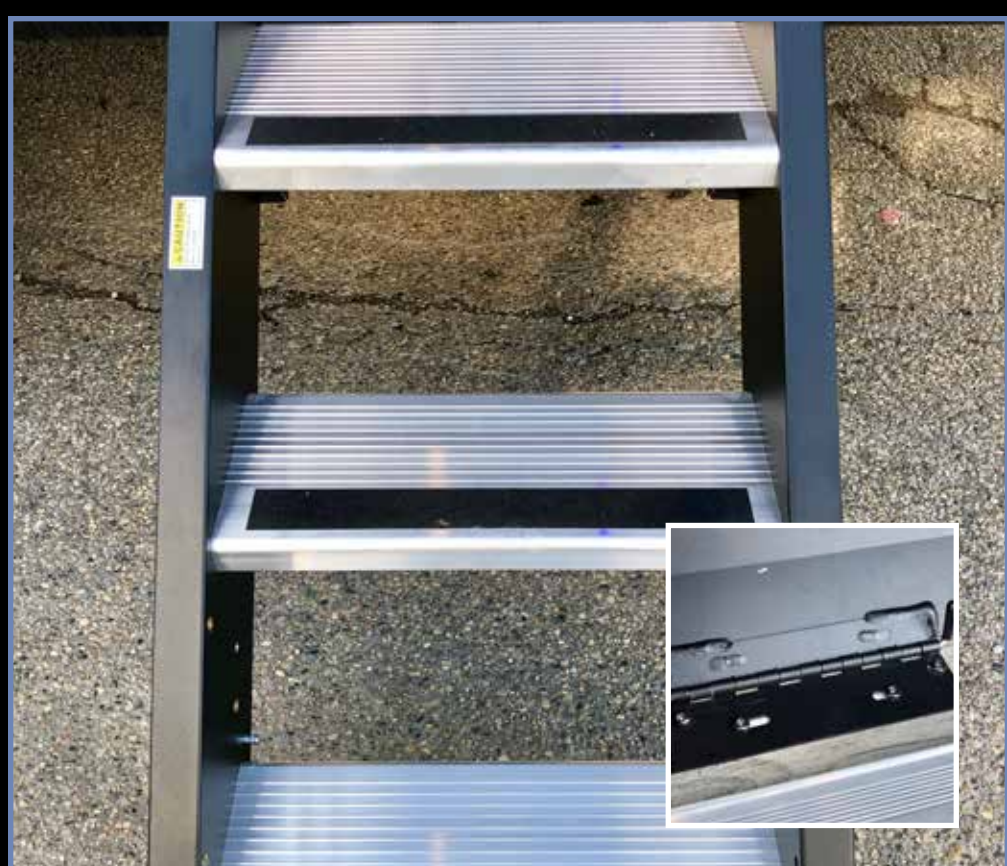
Cherokee Exclusive Exterior Steps with Oversized Landing, 600LB. Capacity, Quick Release and Kick Plate