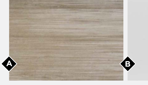
A. Standard Matte Porcelain Flooring