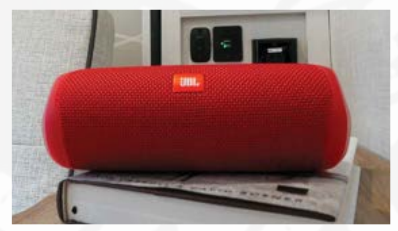
JBL PORTABLE BLUETOOTH SPEAKER FOR MUSIC ON THE GO