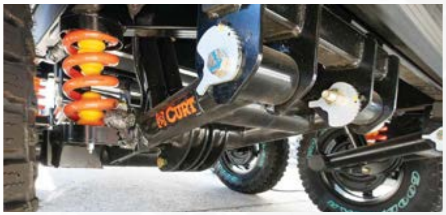
CURT BEAST MODE INDEPENDENT SUSPENSION SYSTEM WITH GOODYEAR ALL-TERRAIN TIRES