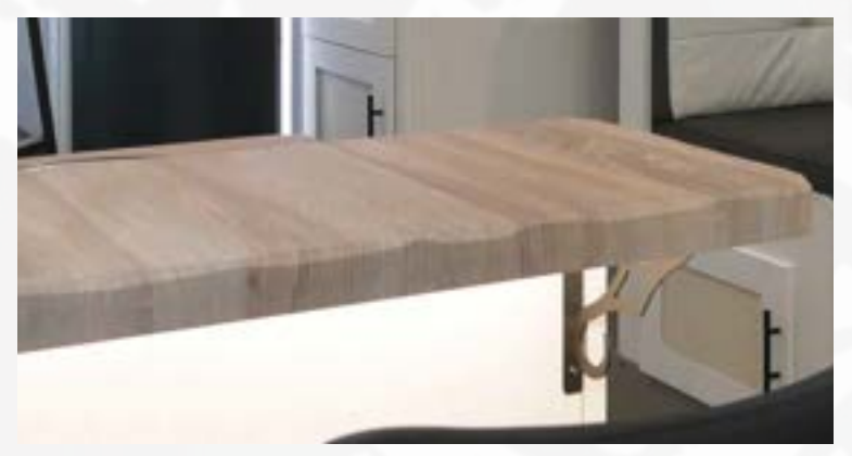
LIVE EDGE ACCENTS CREATE A HANCRAFTED LOOK