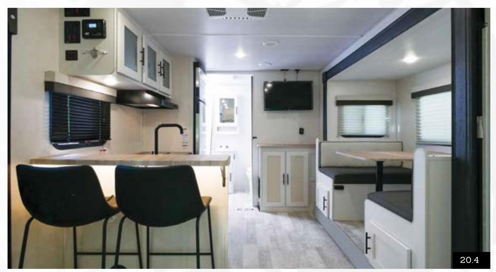
ALL-NEW ASPEN FROST INTERIOR DESIGN FEATURING PREMIUM FLOORING, ACCENT LIGHTING, AND CABINETRY