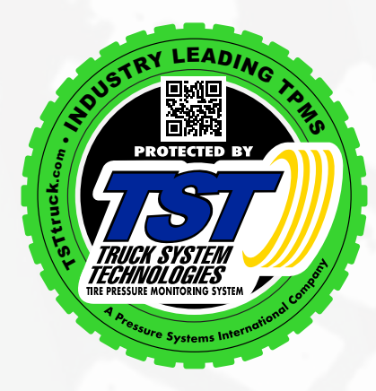
TIRE PRESSURE MONITORING SYSTEM