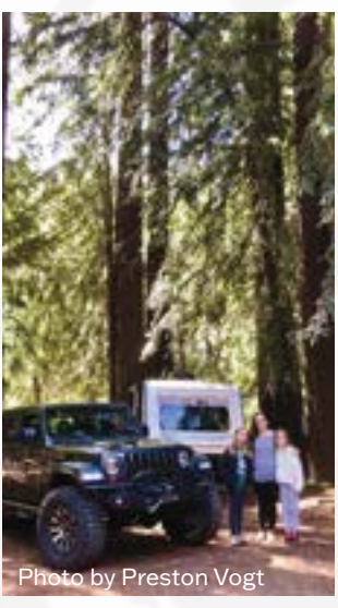
follow the journey