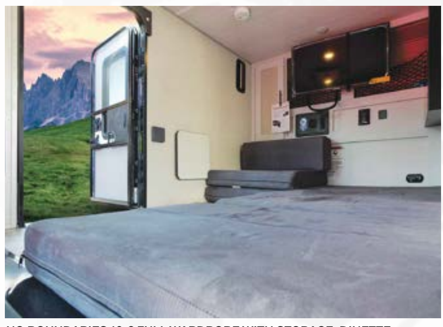
NO BOUNDARIES 10.6 FULL WARDROBE WITH STORAGE, DINETTE, OPTIONAL 12V TV AND 60^\circ x 82^\circ LOUNGER.