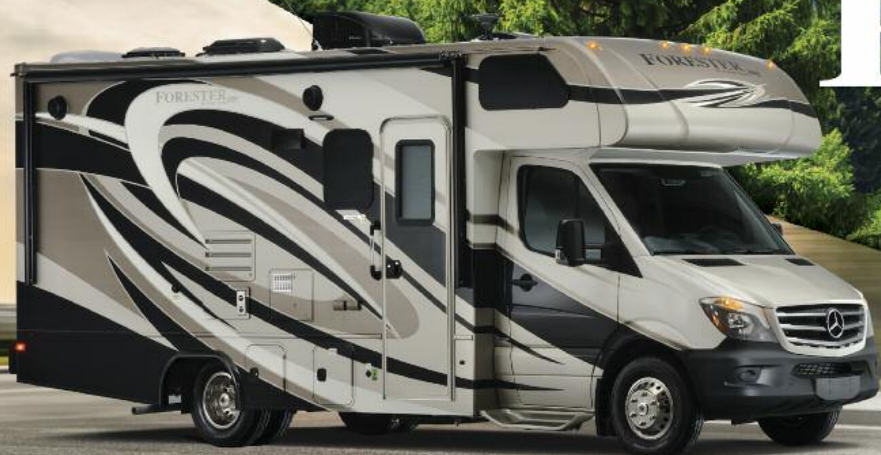
2401W Shown with full body paint option