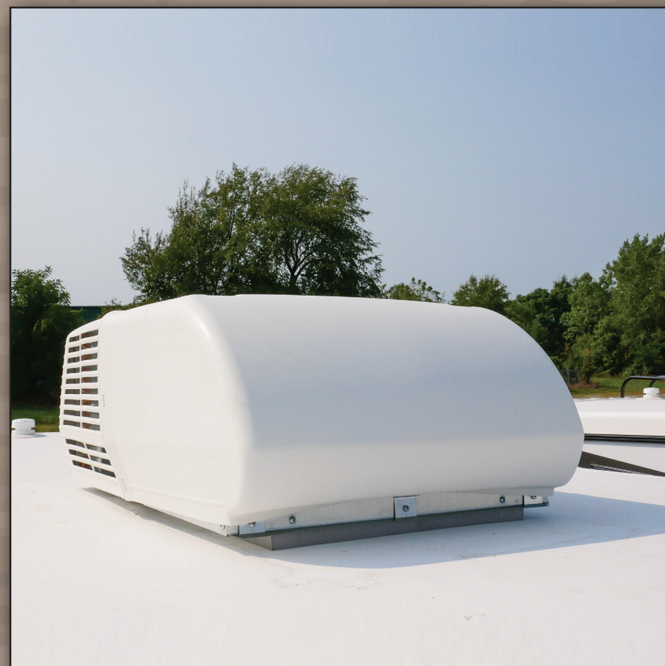
TWO 15K BTU A/C SYSTEM