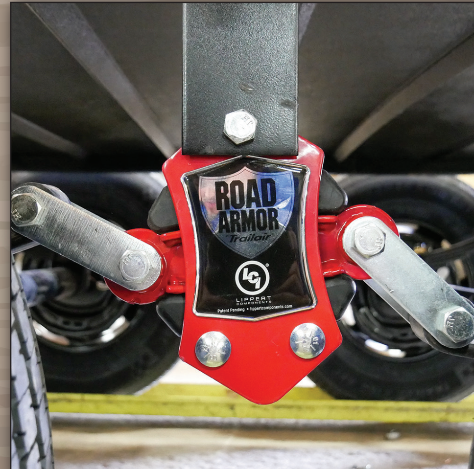
ROAD ARMOR SUSPENSION