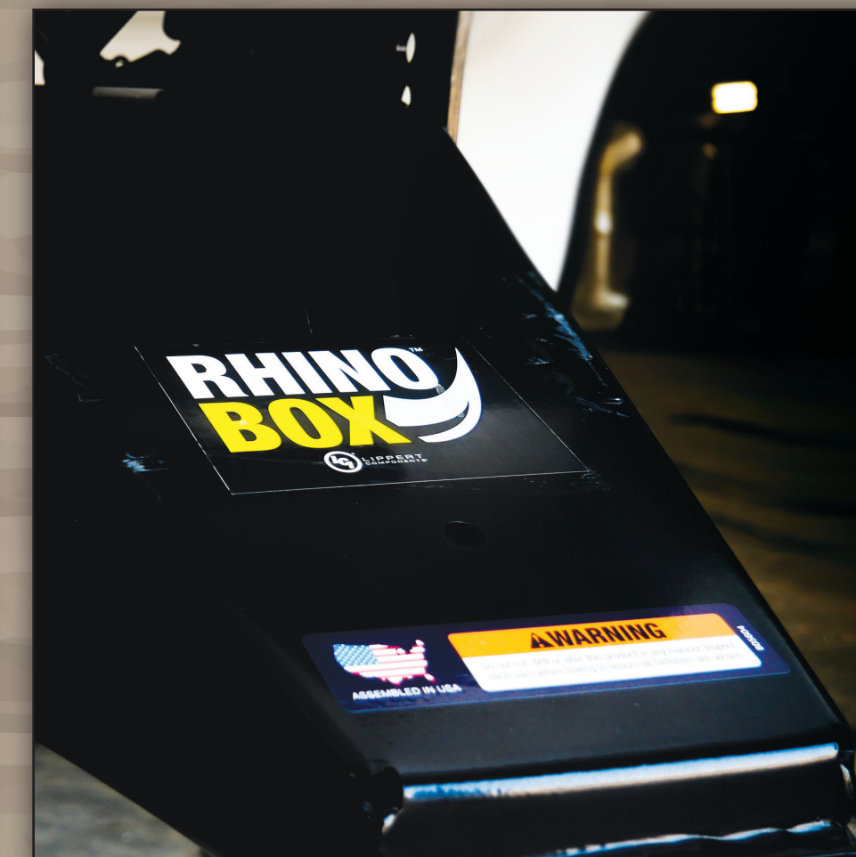
21K RHINO PIN BOX