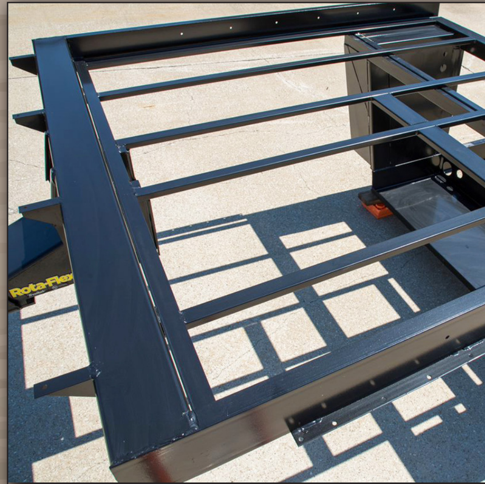
NEXT GENERATION Z-FRAME TECHNOLOGY