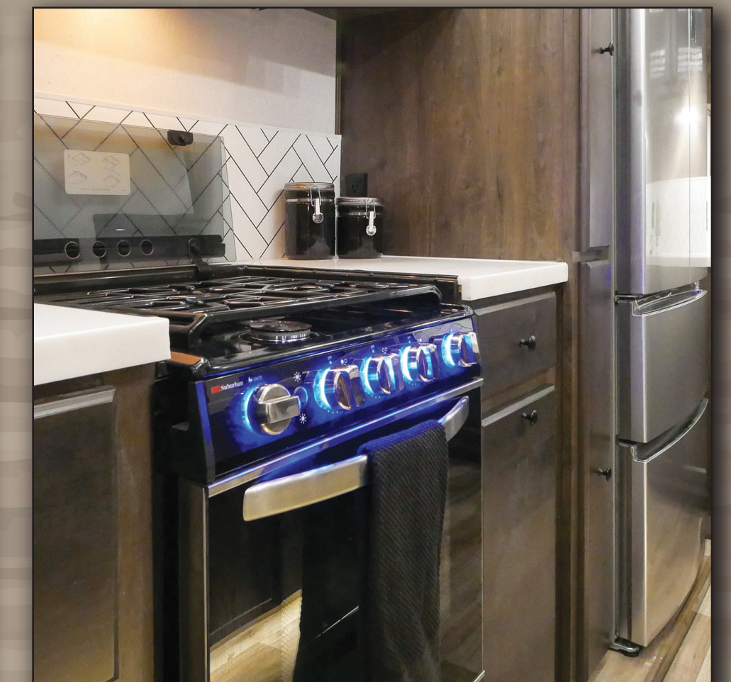
21" COMBINED OVEN AND COOKTOP