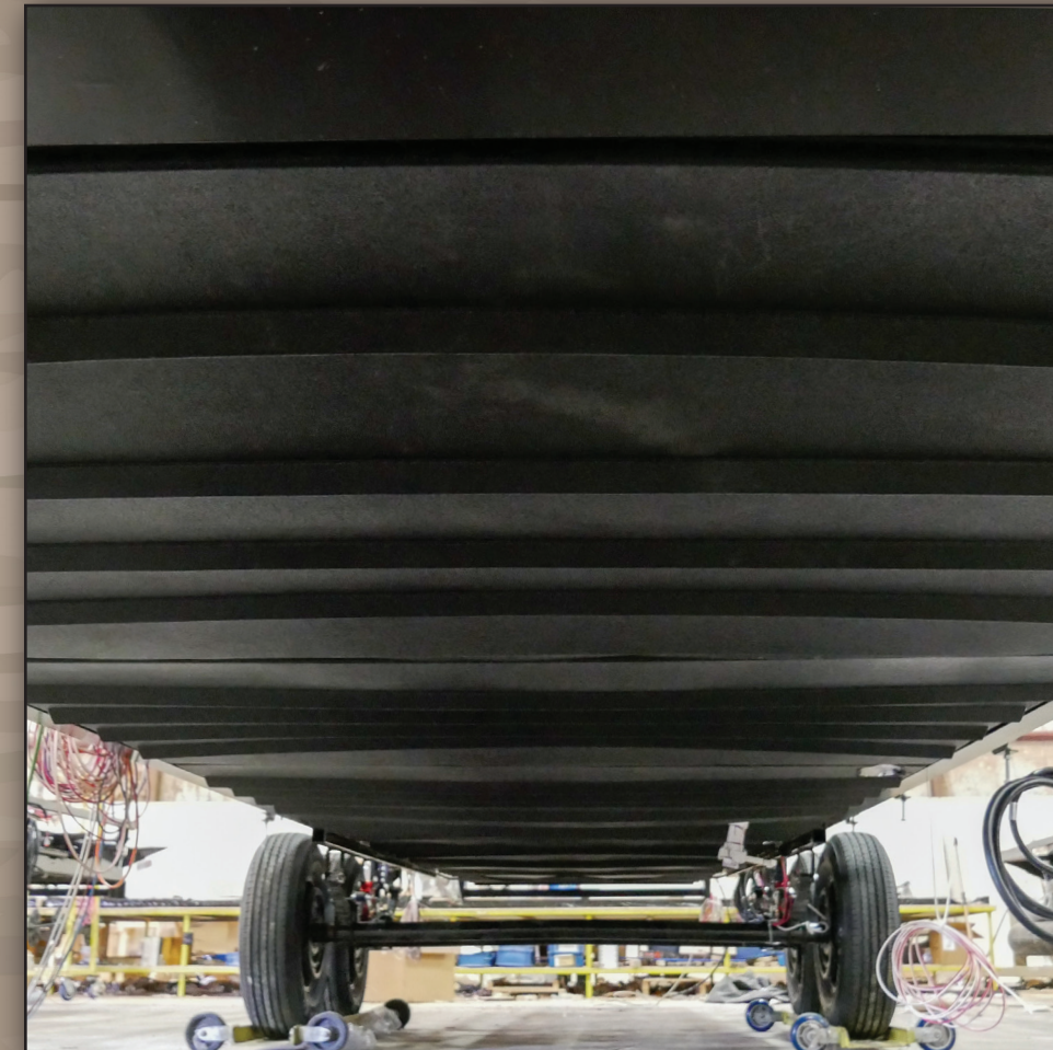
UNDERBELLY ARMOR — REMOVABLE ABS PANELS