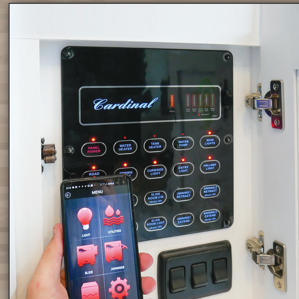
APP CONTROLLED SYSTEMS PANEL