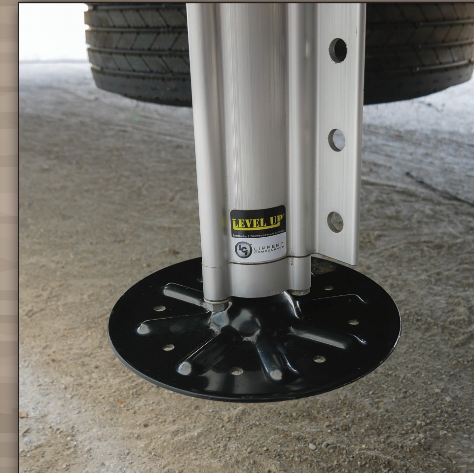
6-POINT HYDRAULIC AUTO LEVELING