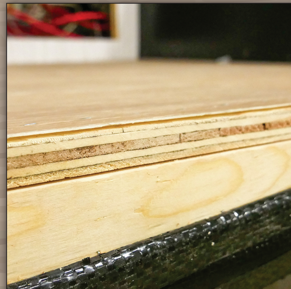
TONGUE & GROOVE PLYWOOD MAIN AND UPPER FLOORS