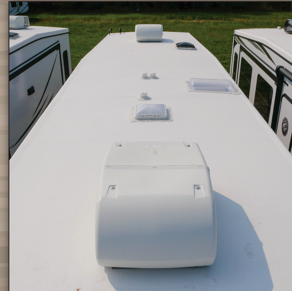
PVC ROOF MATERIAL WITH VENTED ROOF DESIGN AND SOLAR PREP