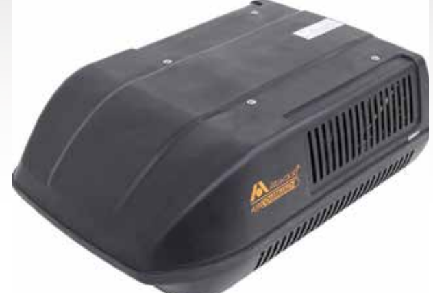
ATWOOD AIR COMMAND OVERSIZED A/C'S

(2) High output Quiet Air Command™ ducted roof A/C's with chill construction, dehumidifier & heat pump (front A/C only). More BTUs for more comfort.