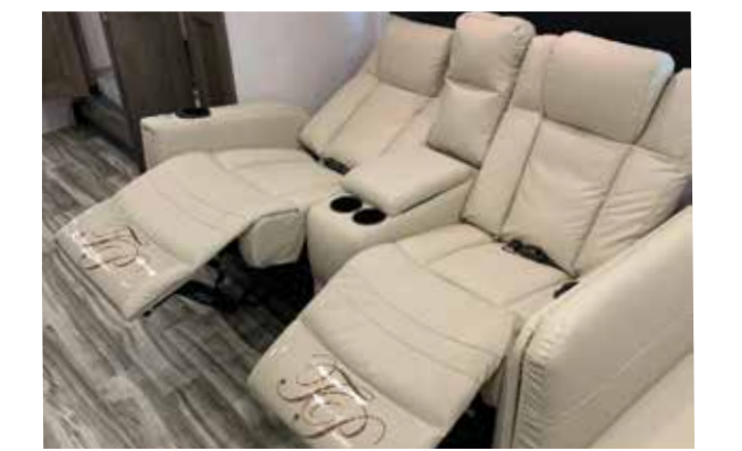
POWER THEATER SEATING

Heated and enclosed compartments wrapped in thermal insulation with forced air from the furnace as well as electronic heat pads on the ing, detachable tray and adjustable headrests. holding tanks and gate valves.