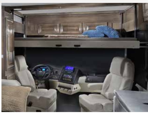
P2K BUNK SYSTEM

Merlin Solar Controller (360W capacity) with 115W solar flex panel. Constant charge to batteries while camping or weekends off!