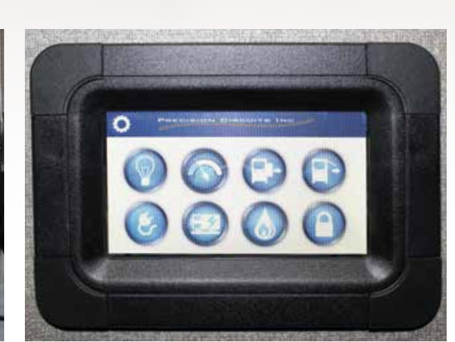
MULTIPLEX LOW VOLTAGE SWITCHING Low voltage electronic systems control for

52x80 electric euro bunk system to rest your head on with a smooth, quiet up and down movement.