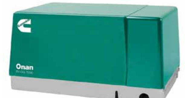
ONAN GENERATOR 7000KW Onan generator.

Luxury power reclining theater seats with heat, massage, 110 USB, indirect LED light-