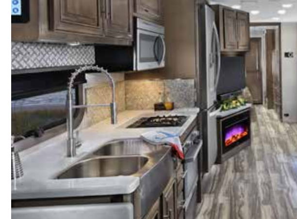
RESIDENTIAL STAINLESS STEEL APPLIANCE PACKAGE

Amish handcrafted 90 sheen hardwood cabinetry throughout with soft close drawer guides and magnetic door catches.