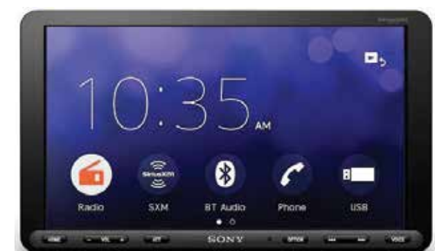
SONY RADIO WITH APPLE CARPLAY & ANDROID AUTO

4pt hydraulic leveling system with auto and manual options. The system will adjust to the grade of the ground keeping your coach level while camping.