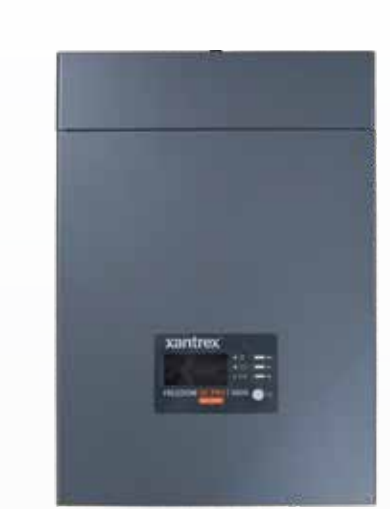
3000 XANTREX INVERTER/CONVERTER

Optional stackable washer/dryer to wash your clothes. No longer making a trip to the laundromat.