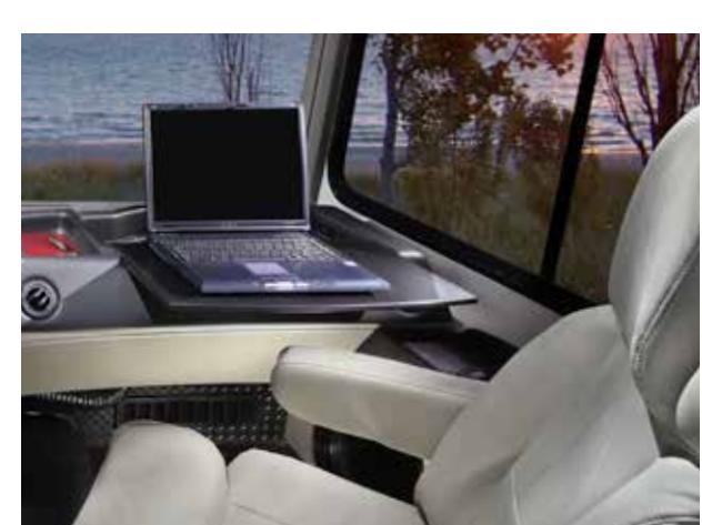
COMPUTER WORK STATION

9.6" screen positioned for the driver to see clear with: Apple Carplay, Android Auto, camera viewing (rear/side), AM/FM radio, bluetooth audio. Conveniently positioned towards the driver's seat and simple to use at a quick glance.