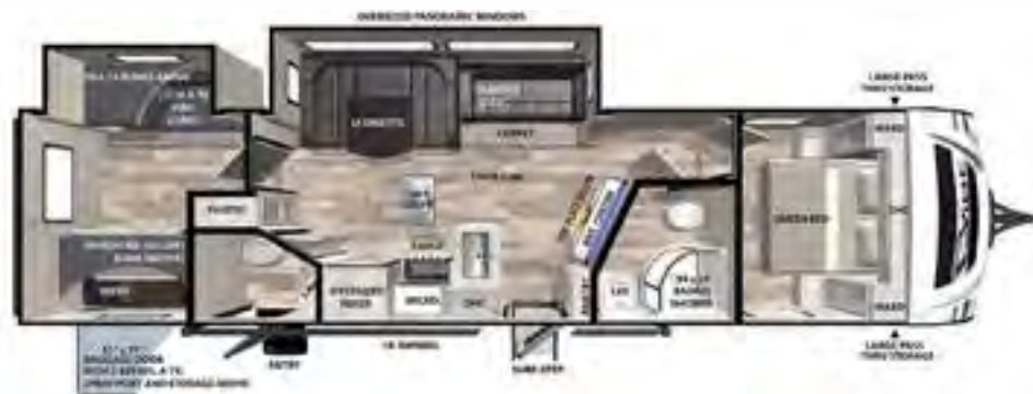
UVW: 7,836 lb. EXTERIOR LENGTH: 38' 3" 32BH