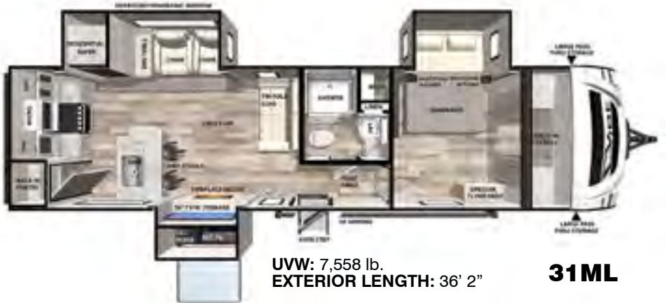
UVW: 7,558 lb. EXTERIOR LENGTH: 36' 2" 31ML