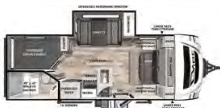
UVW: 5,245 lb. EXTERIOR LENGTH: 25' 7" 21BH