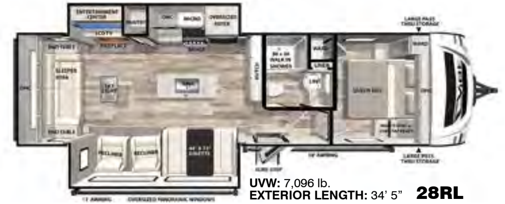
UVW: 7,096 lb. EXTERIOR LENGTH: 34' 5" 28RL