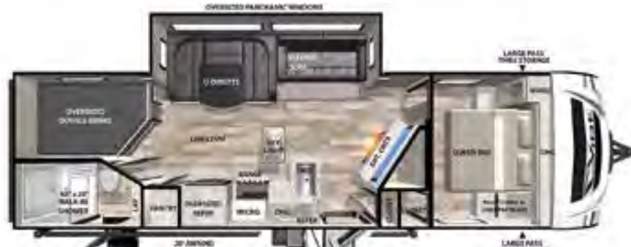
UVW: 6,348 lb. EXTERIOR LENGTH: 33' 10" 26BH