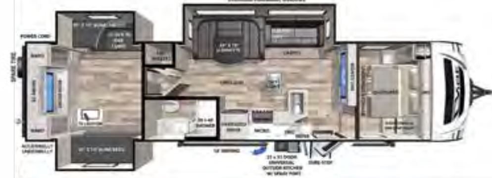
UVW: 7,740 lb. EXTERIOR LENGTH: 38' 0" 33BH