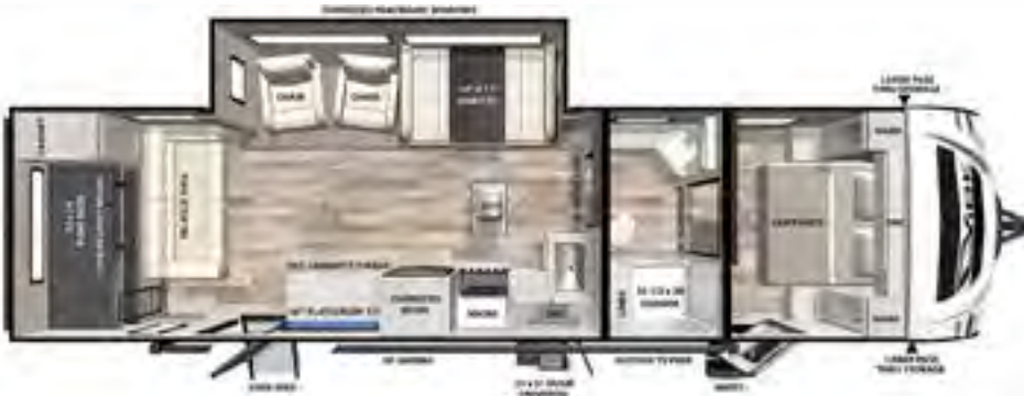
UVW: 6,884 lb. EXTERIOR LENGTH: 35' 8" 32MS