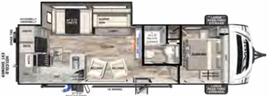
UVW: 6,664 lb. EXTERIOR LENGTH: 33' 6" 26RK