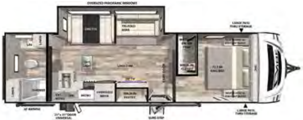
UVW: 6,691 lb. EXTERIOR LENGTH: 34' 2" 28RB