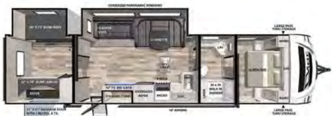
UVW: 7,391 lb. EXTERIOR LENGTH: 38' 0" 29BH