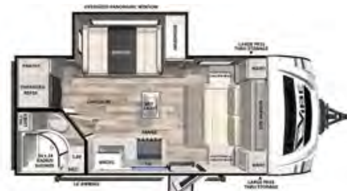
UVW: 4,730 lb. EXTERIOR LENGTH: 21' 11" 18RB