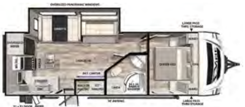
UVW: 5,888 lb. EXTERIOR LENGTH: 29' 2" 25RK