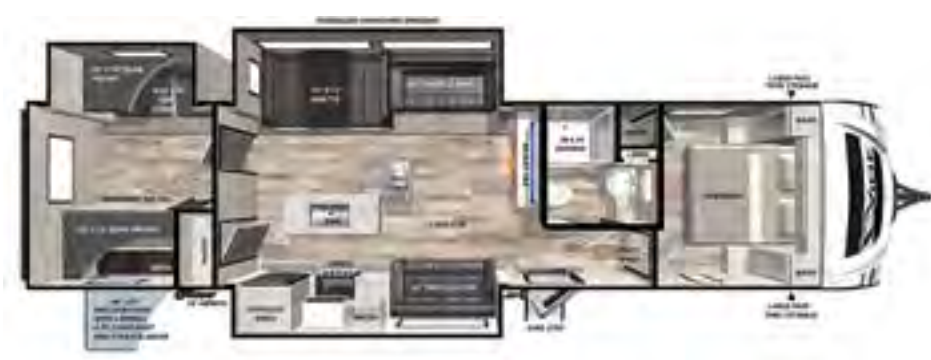
UVW: 8,164 lb. EXTERIOR LENGTH: 39' 5" 34BH