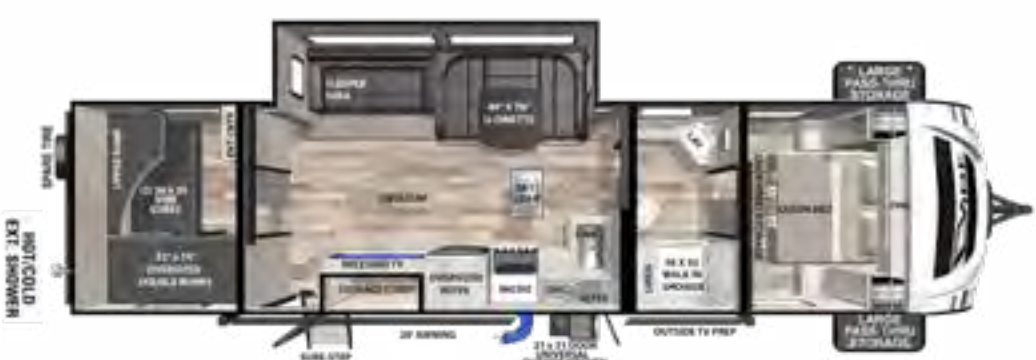
UVW: 6,875 lb. EXTERIOR LENGTH: 36' 6" 28BH