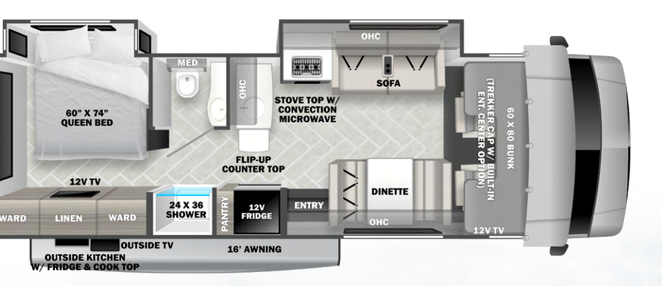
2861DS (Available on Ford E450)