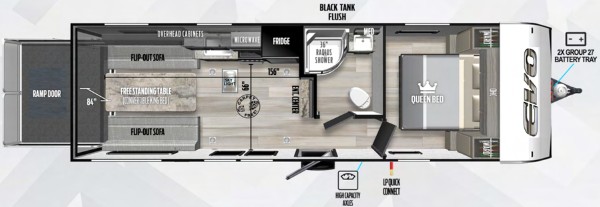
25TH LENGTH: 28' 11" UVW: 5493 LBS