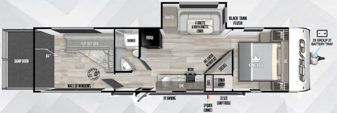
29TH LENGTH: 36' 3" UVW: 7962 LBS