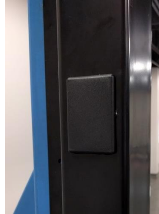
Version with plastic cover