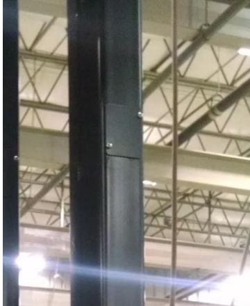
Version With Screws